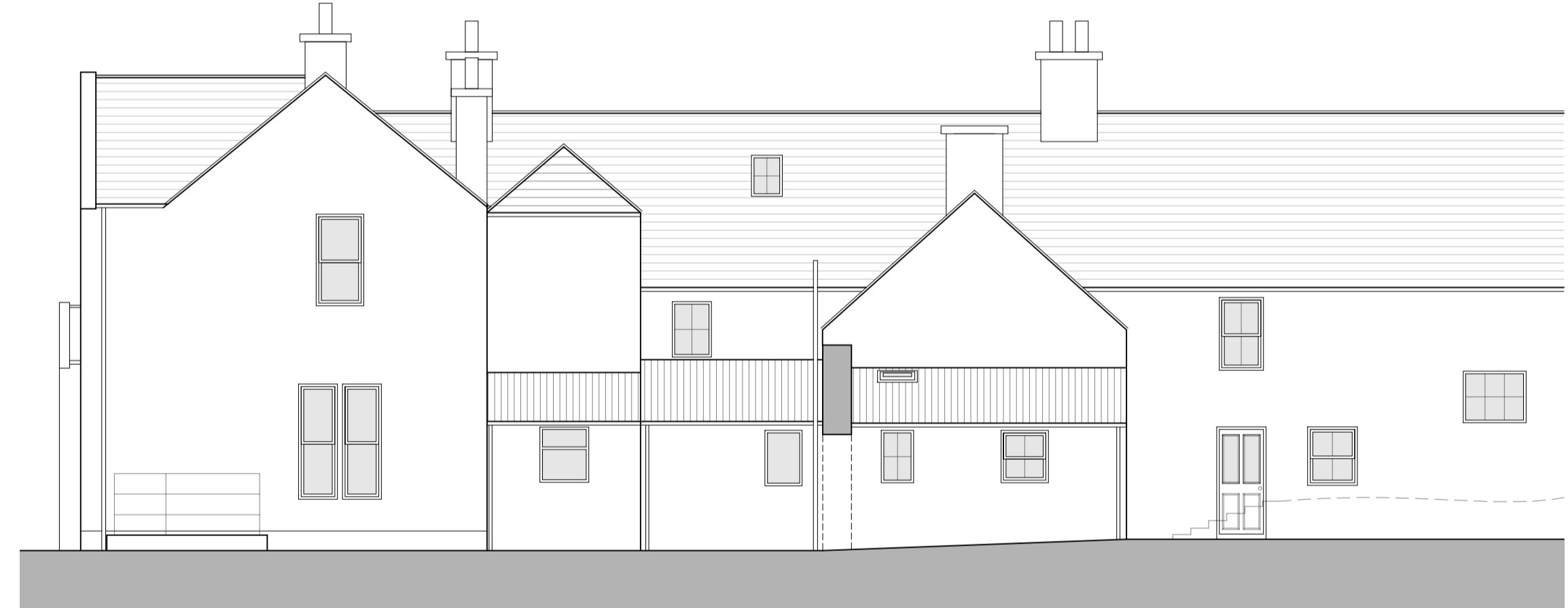
4 EAST ELEVATION 1:100