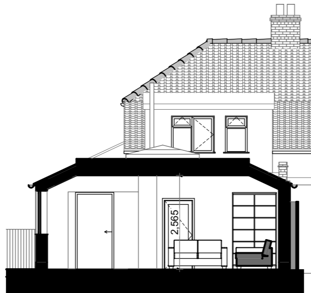
Section B:B 1:100