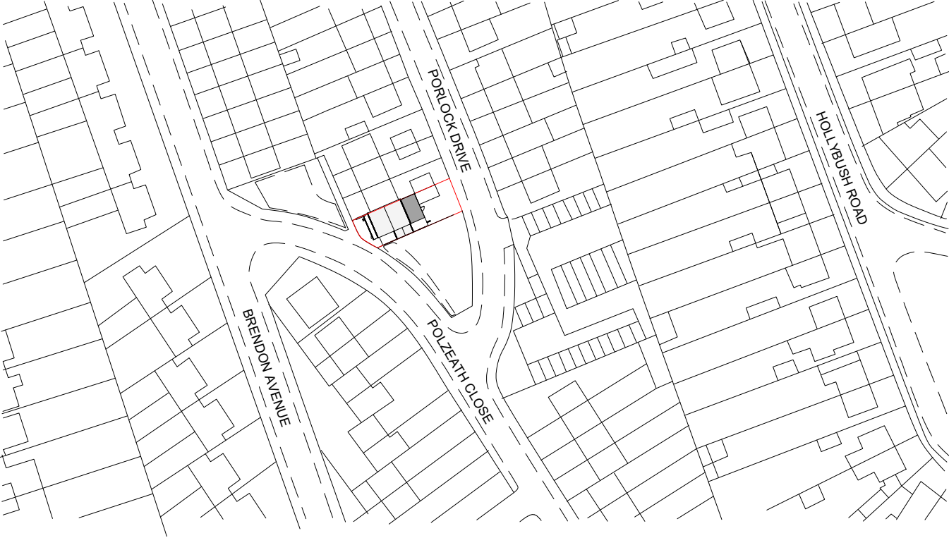
Site Location Plan 1 : 1250