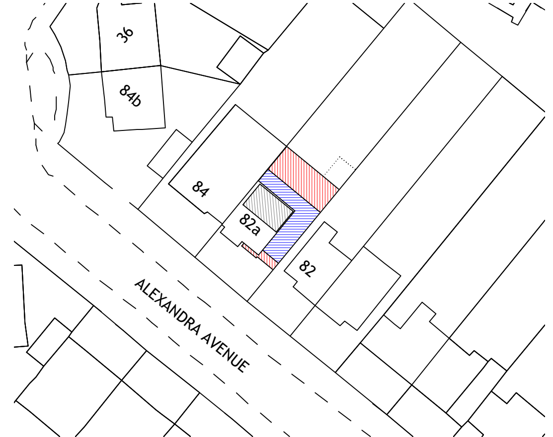
block plan scale 1:500