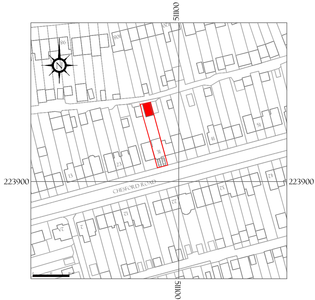
LOCATION MAP SCALE: 1:1250