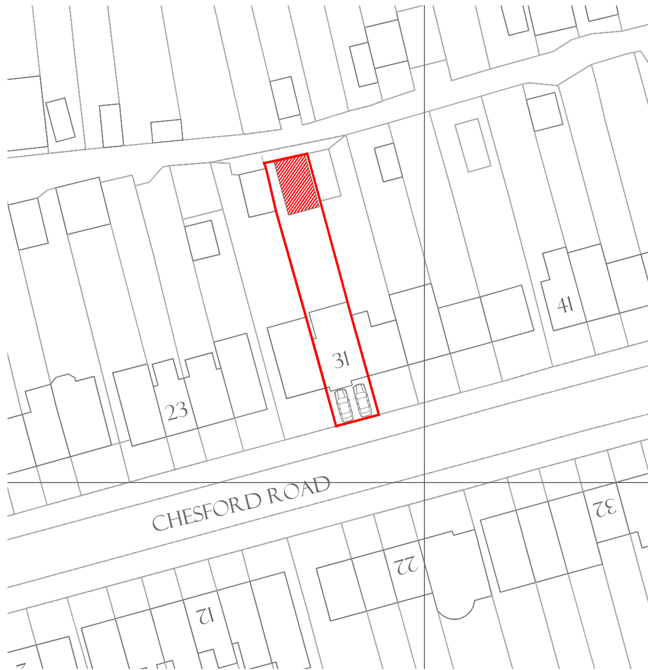
BLOCK PLAN SCALE: 1:500