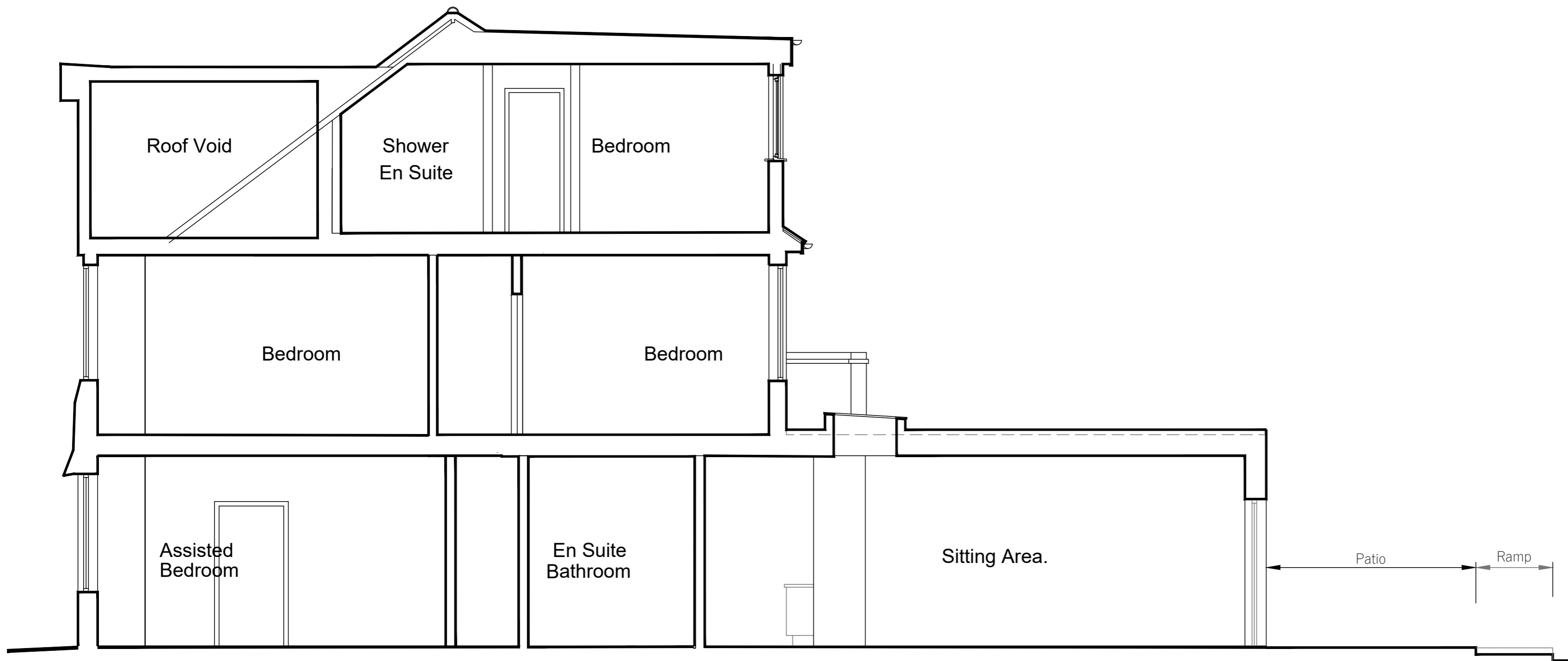
SECTION B-B AS PROPOSED.