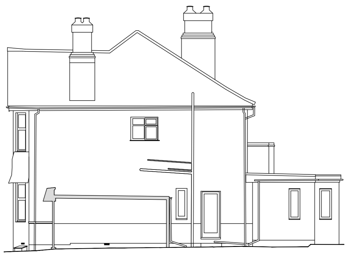
BOUNDARY ELEVATION (No 46) AS EXISTING.