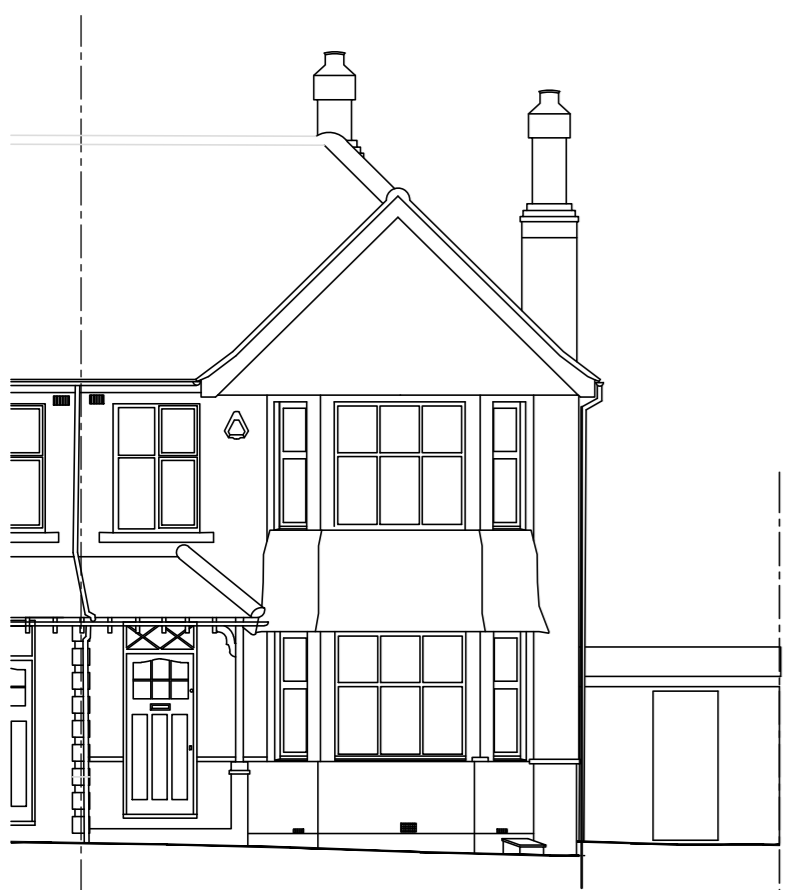
FRONT ELEVATION AS EXISTING.