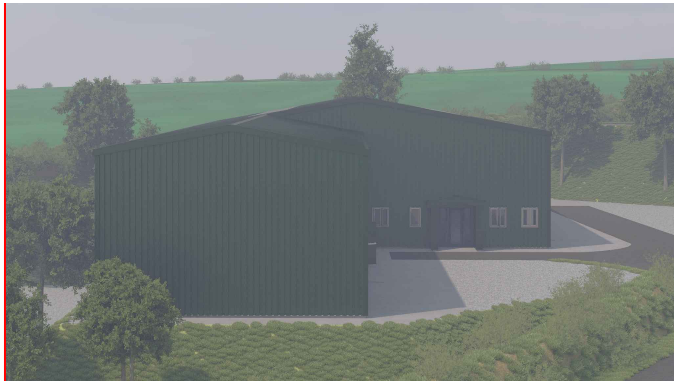
PROPOSED SOUTH EAST ELEVATION 1:100