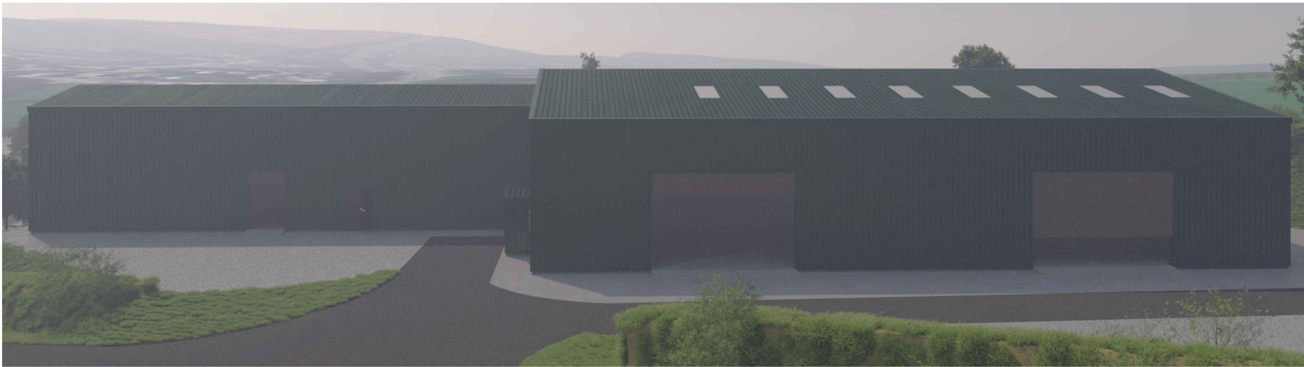
PROPOSED NORTH EAST ELEVATION 1:100