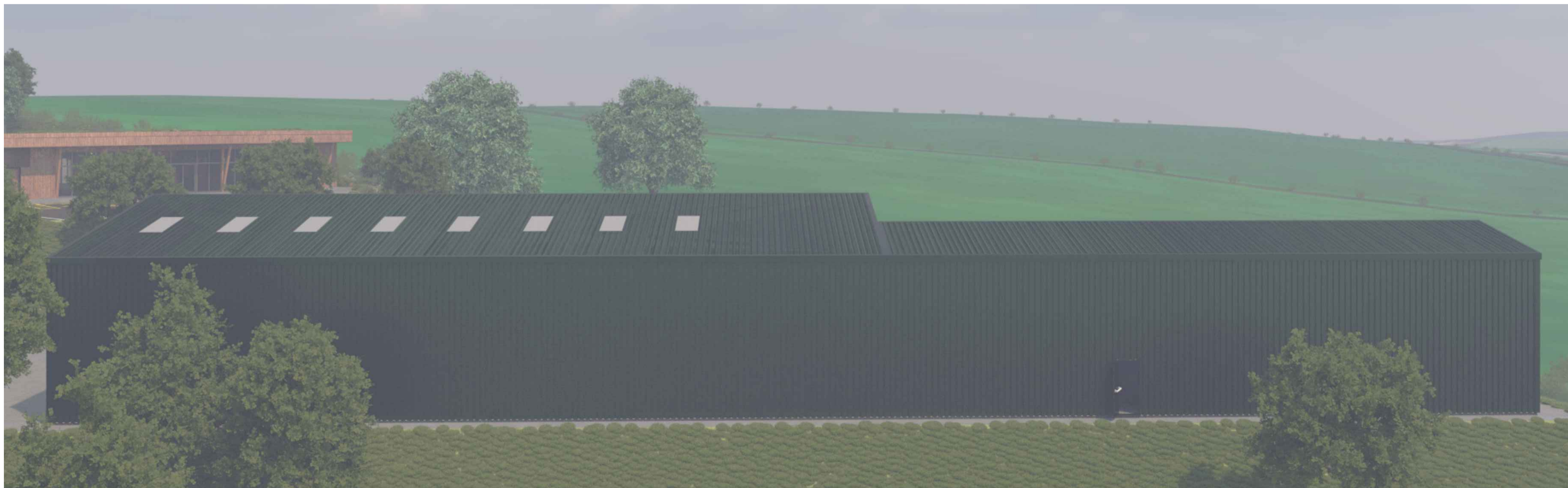
PROPOSED SOUTH WEST ELEVATION 1:100