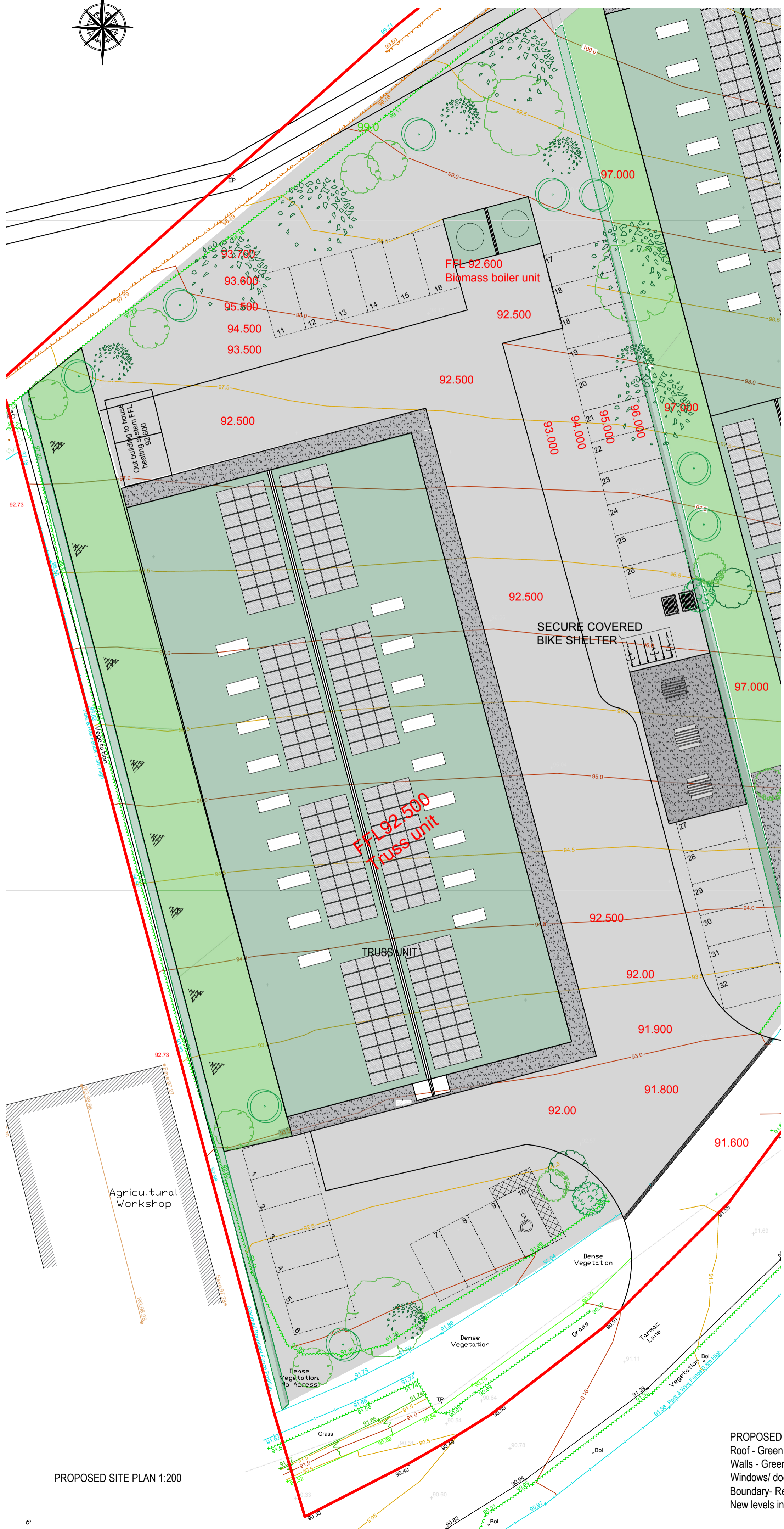
PROPOSED SITE PLAN 1:200

PROPOSED FINISHES: Roof - Green metal profiled sheeting Walls - Green metal profiled sheeting Windows/ doors - Aluminum Boundary- Retain existing. Graded banks with hedges for plot division New levels indicated in red