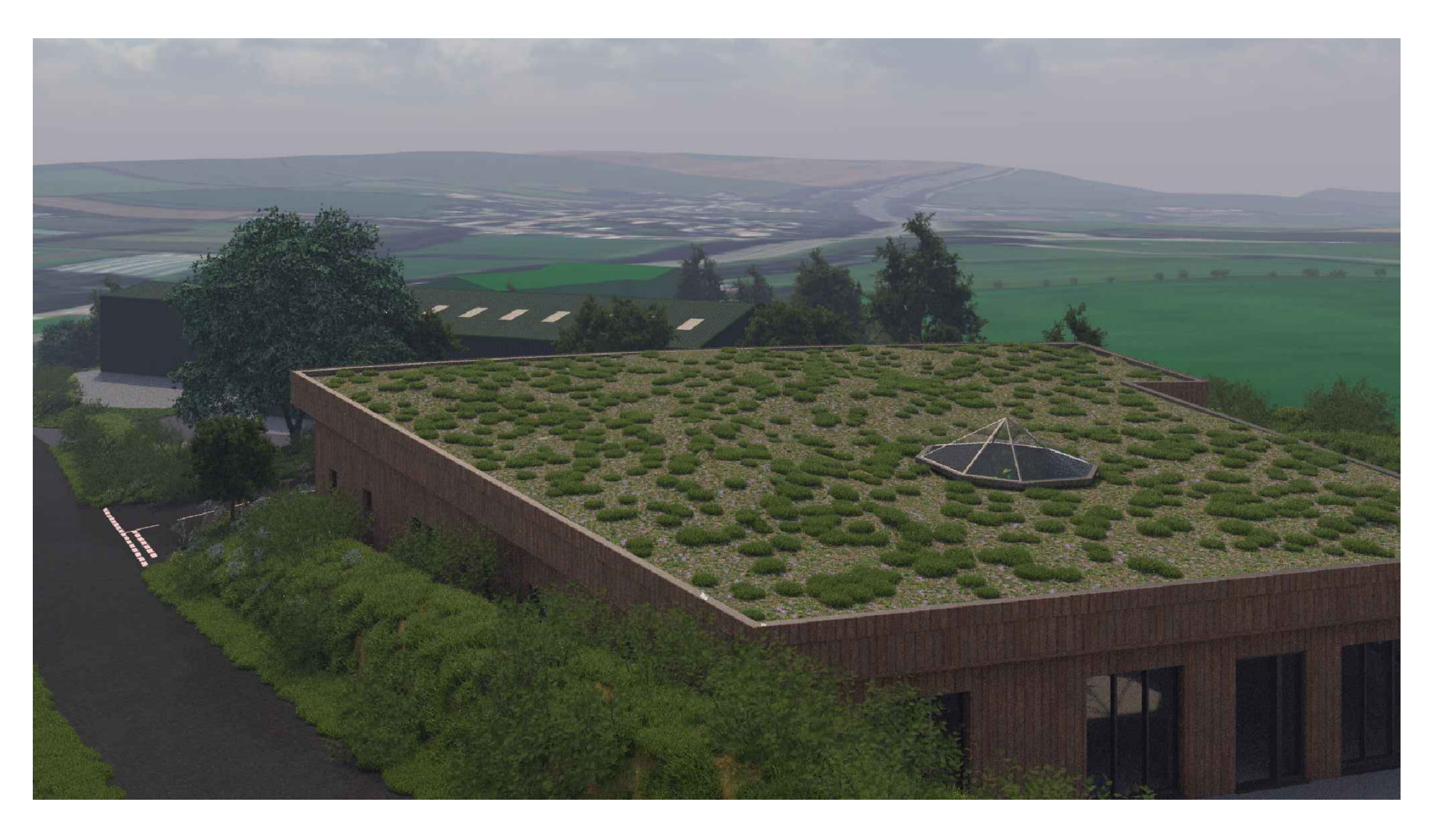
SITE VIEW LOOKING TOWARDS THE SOUTH WEST