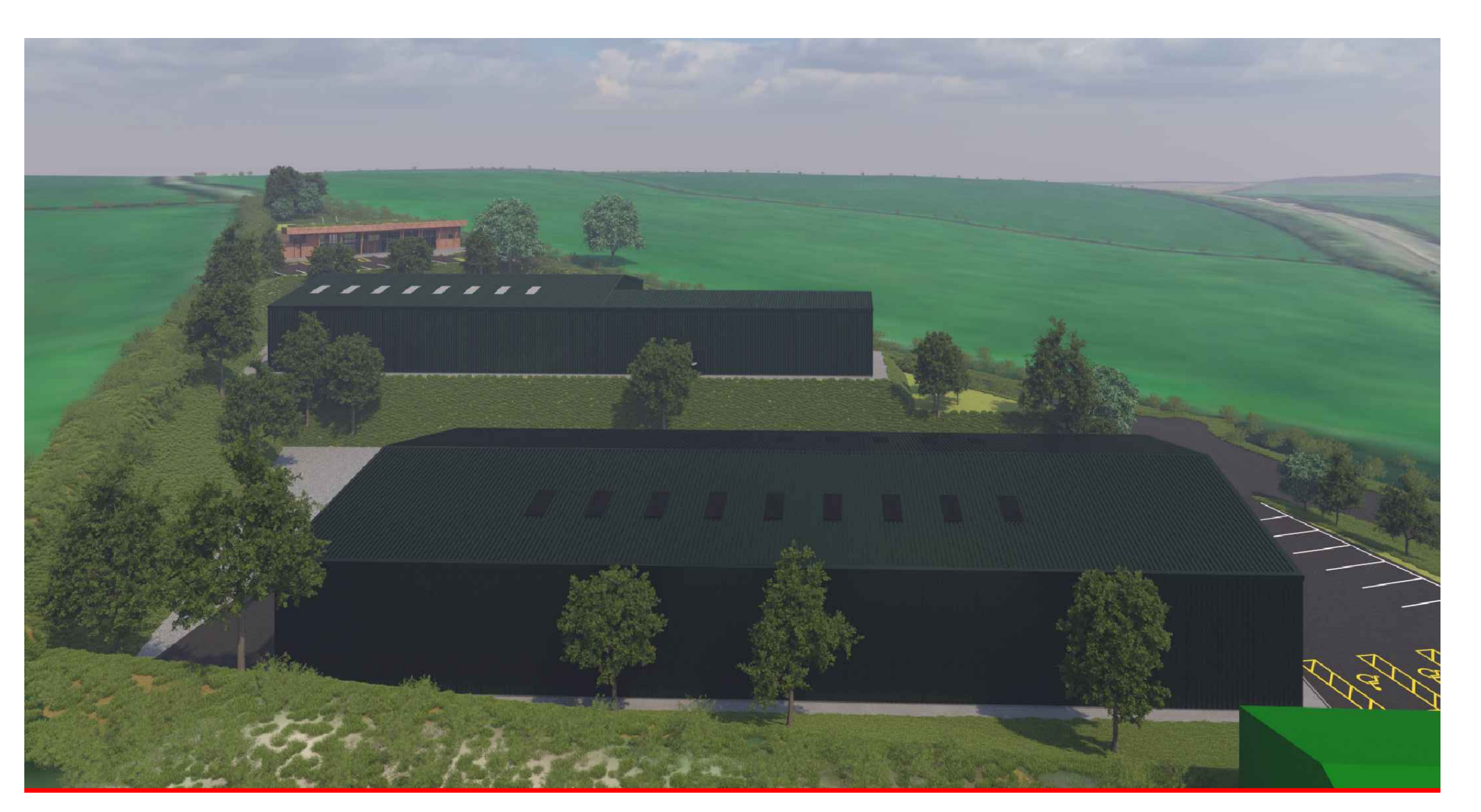
SITE VIEW LOOKING TOWARDS THE NORTH EAST