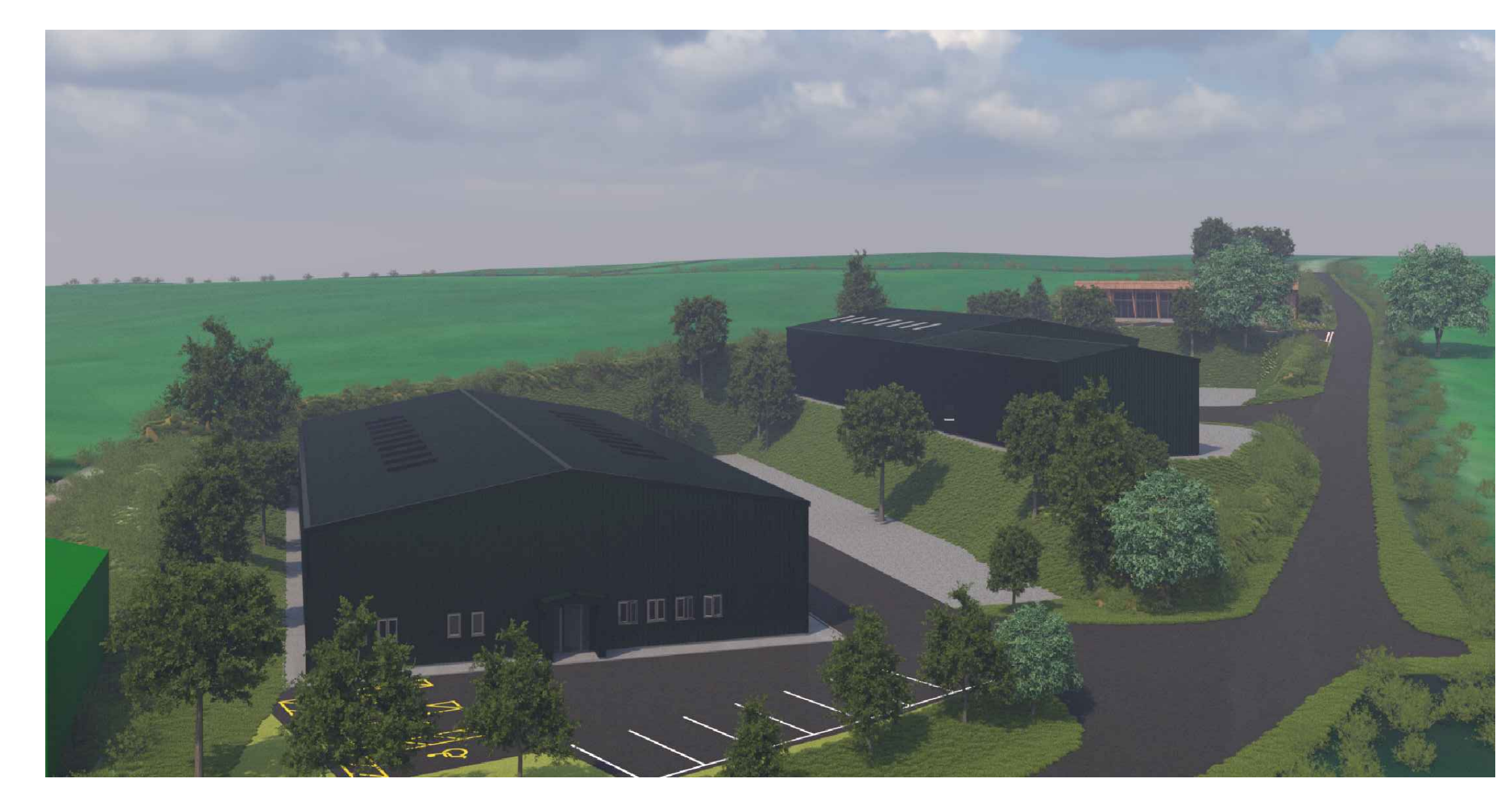
SITE VIEW LOOKING TOWARDS THE NORTH