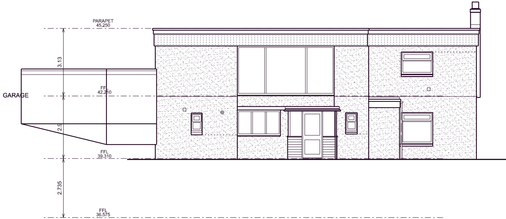
NORTH ELEVATION: EXISTING