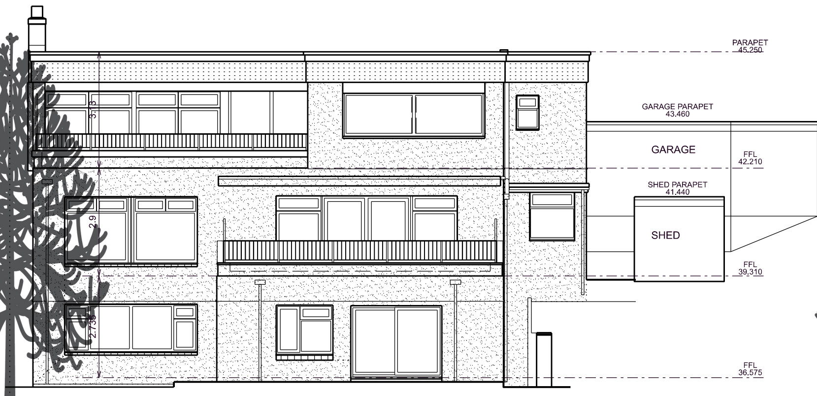
SOUTH ELEVATION: EXISTING

EXISTING ELEVATIONS (NORTH & SOUTH) DRAWING: 03B / REVISION: -