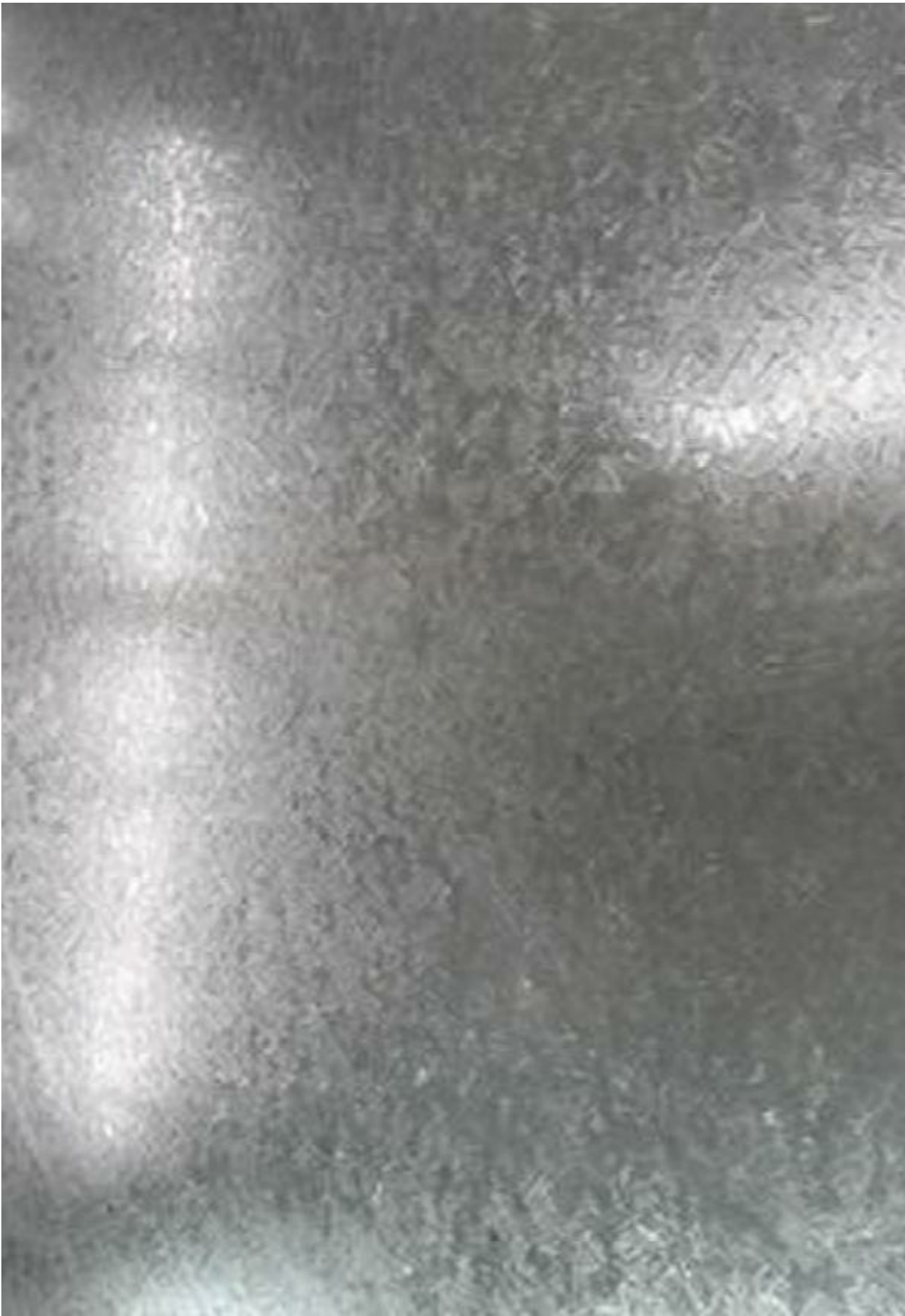
3 / 4 / 5 / 9 / 10. Galvanised steel

Weston Williamson + Partners (WW+P) is the owner of the copyright subsisting in these drawings, plans, designs and specifications. They must not be used, reproduced or copied, in whole or in part, nor may the information, ideas and concepts therein contained (which are confidential to WW+P) be disclosed to any person without the prior written consent of that company. 1. Do not scale drawings. Written dimension govern. 2. All dimensions are in millimetres unless noted otherwise. 3. All dimensions shall be verified on site before proceeding with the work. WW+P shall be notified in writing of any discrepancies. 4. This drawing must be read in conjunction with all relevant contracts, specifications and drawings. 5. Check all levels against survey drawings to surrounding works area. 6. All levels have been provided by the Surveyor.