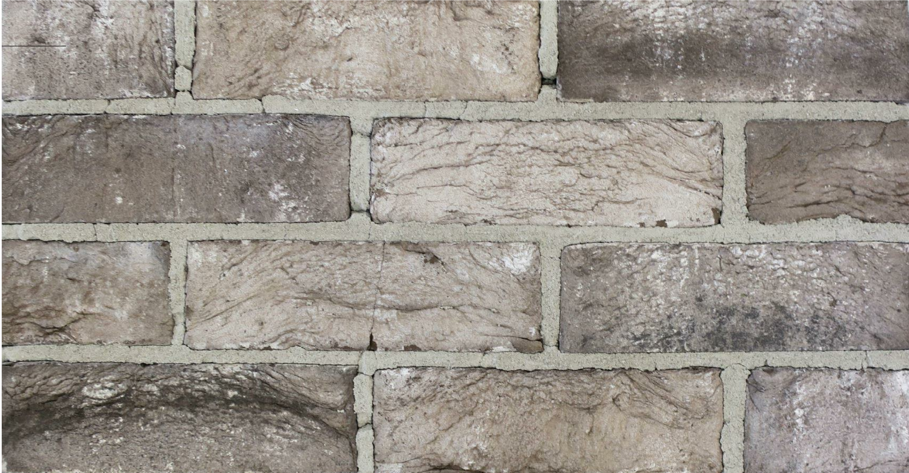
1. Grey brick laid in stretcher bond (S. Anselmo)