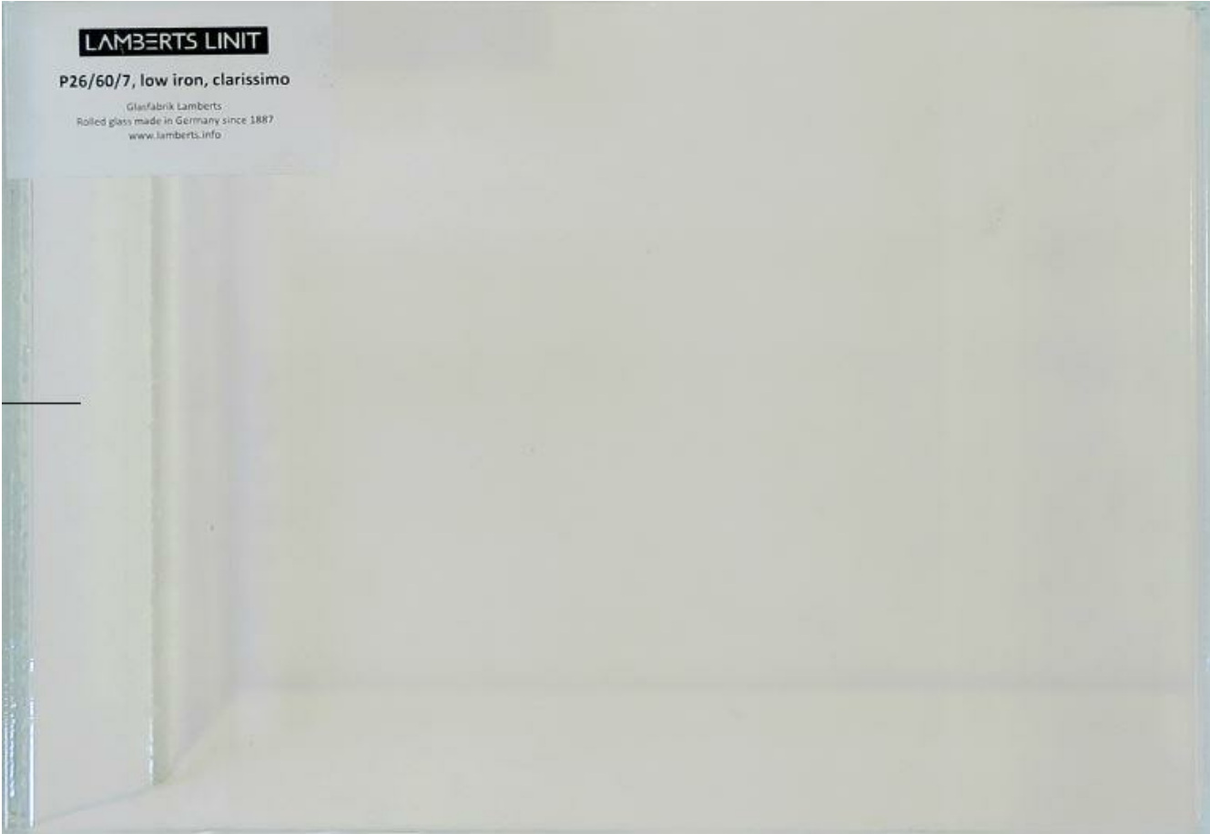
6. U-Channel clear wired glazing system