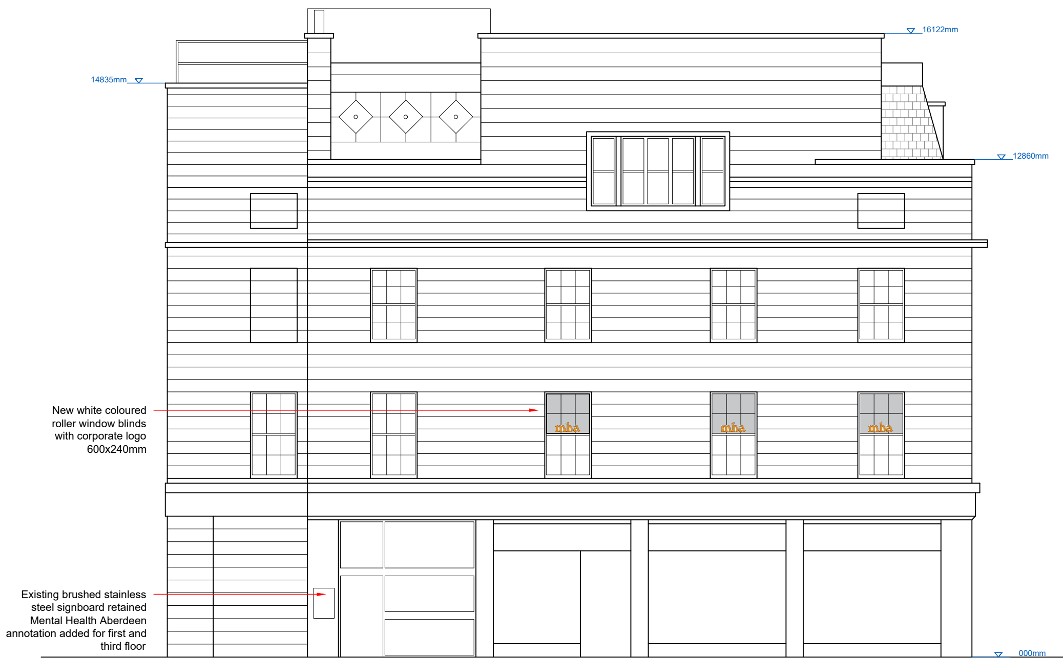
Proposed East Elevation - 1:100