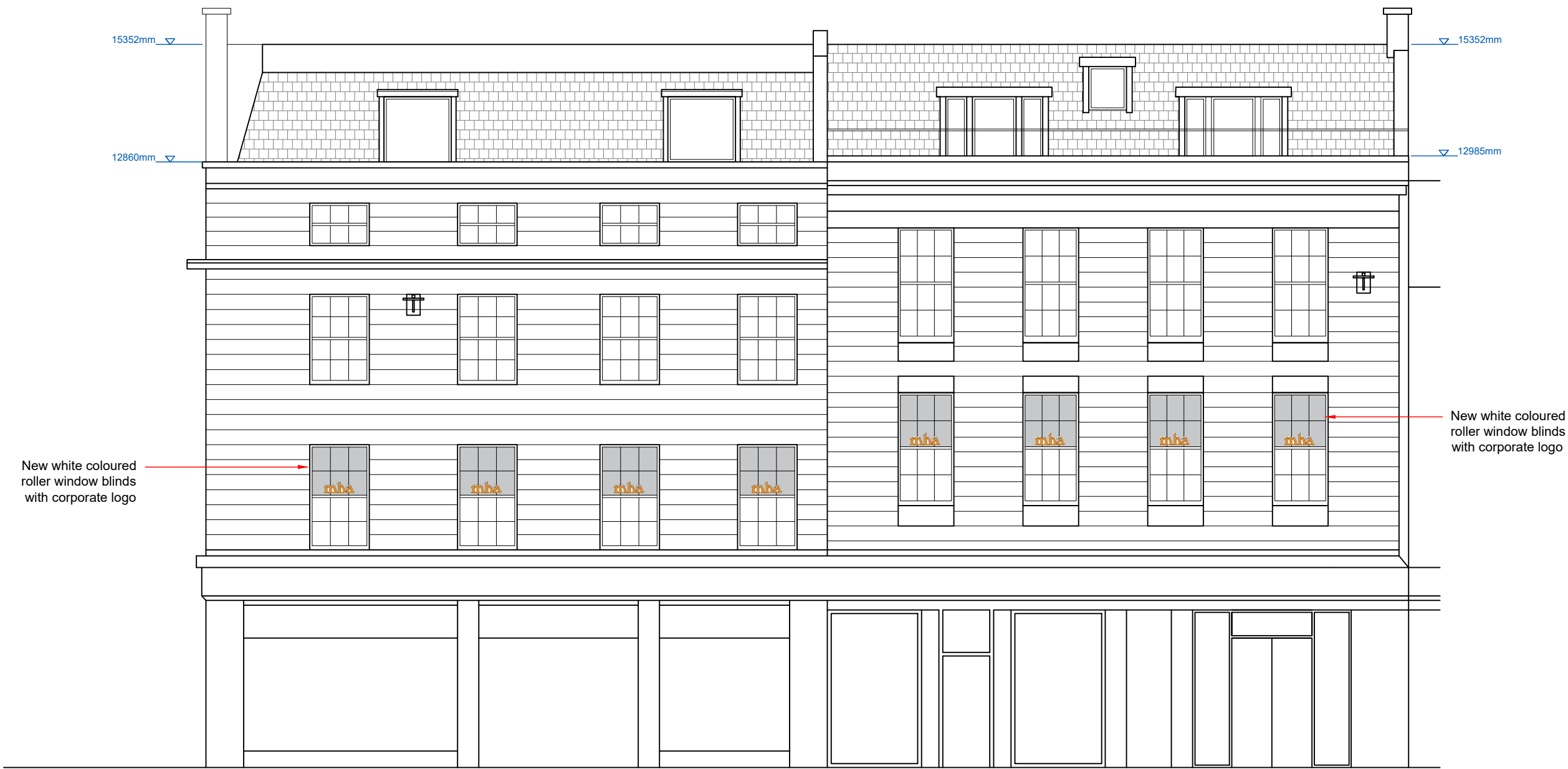
Proposed North Elevation - 1:100