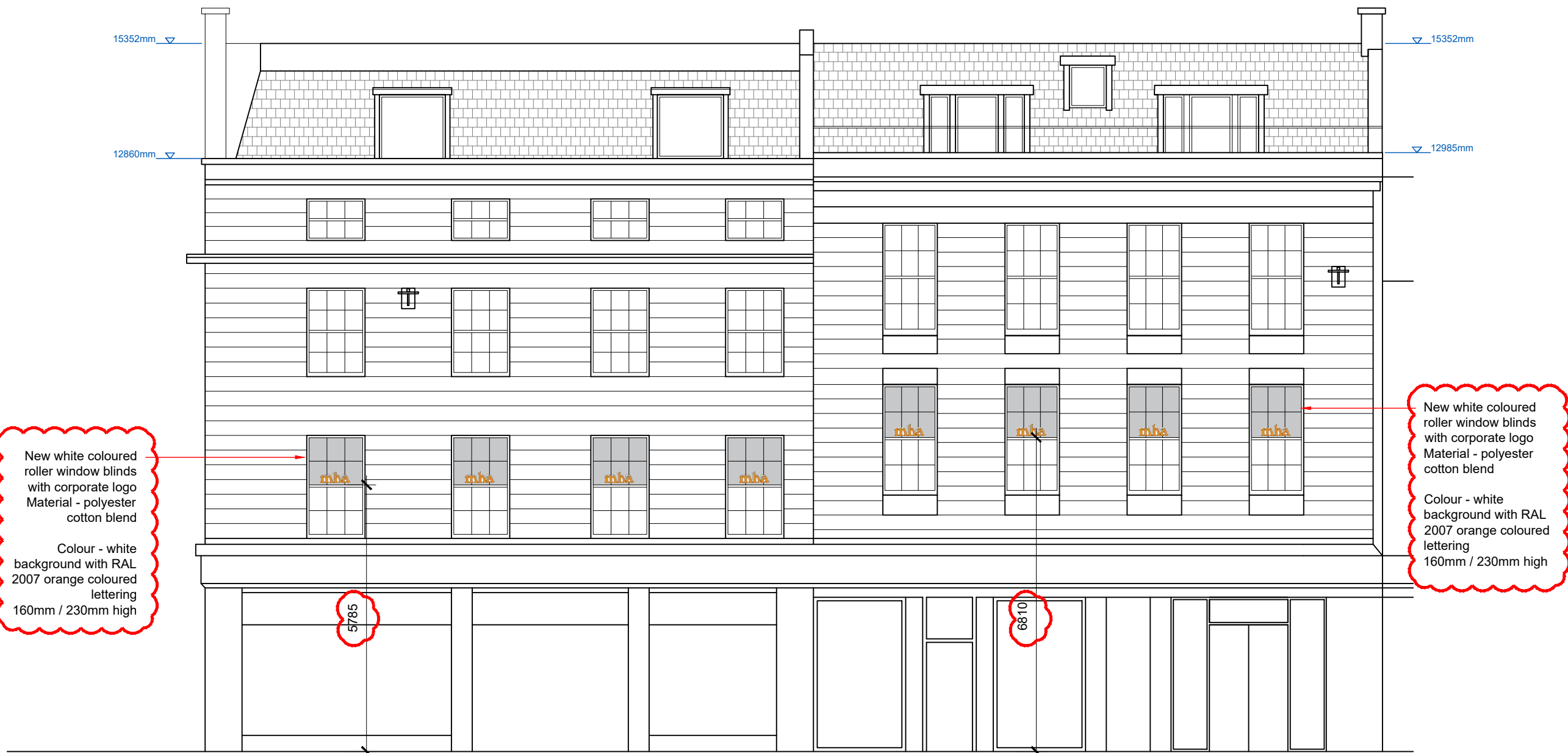
Proposed North Elevation - 1:100