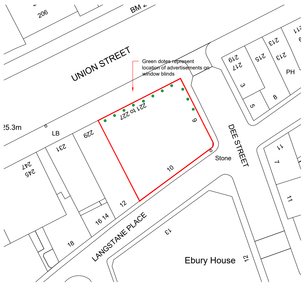
Site Plan - 1:500