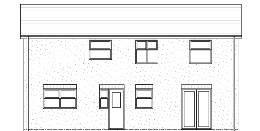
South East Elevation as Existing 1:100