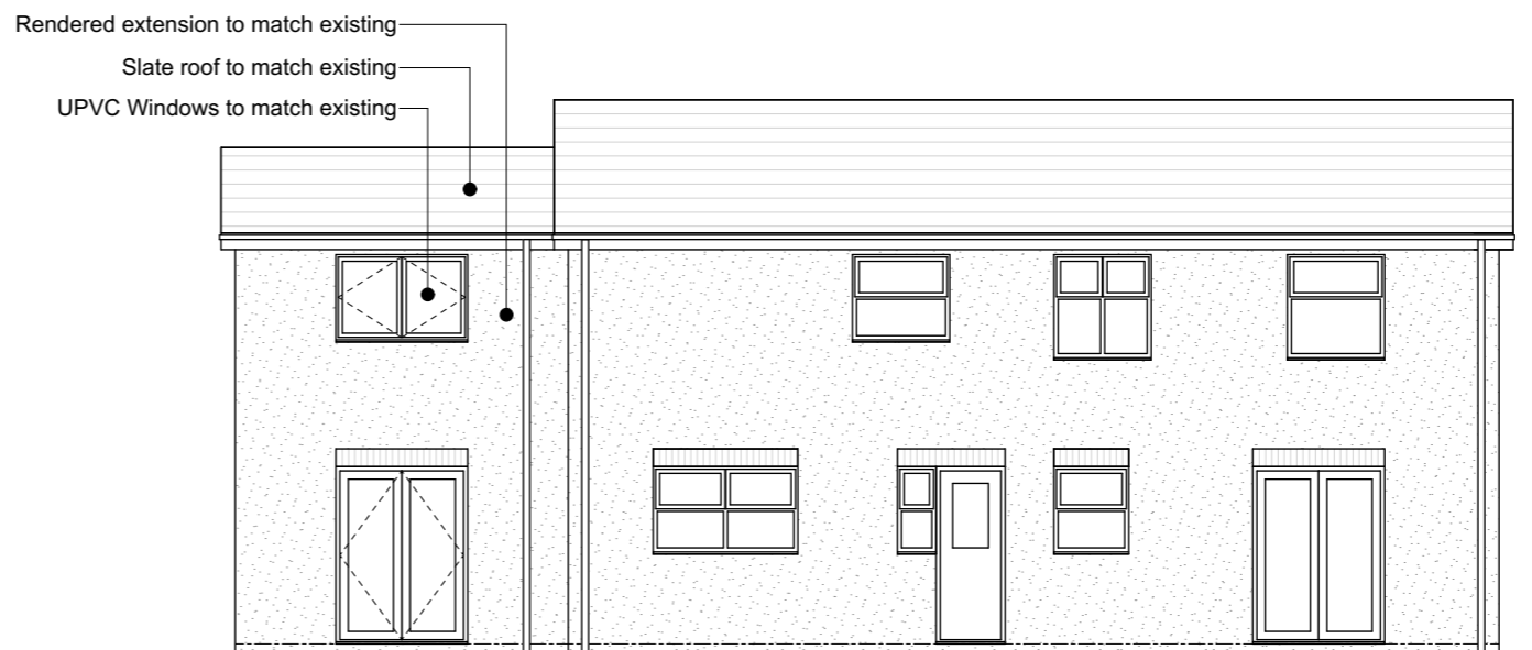
South East Elevation as Proposed 1:100

Rendered extension to match existing Slate roof to match existing UPVC Windows to match existing