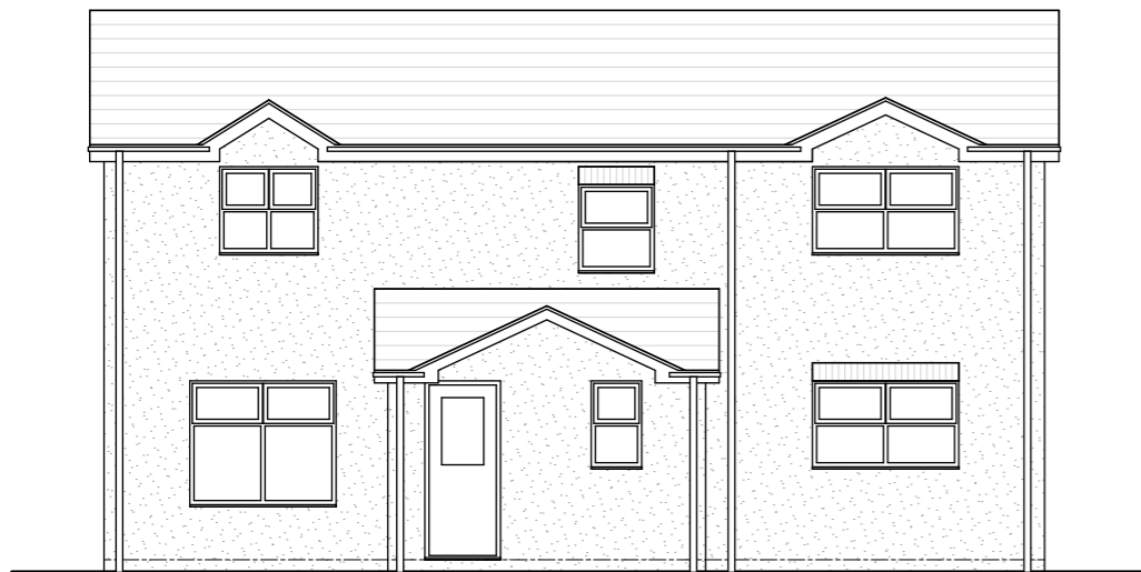
North West Elevation as Existing 1:100