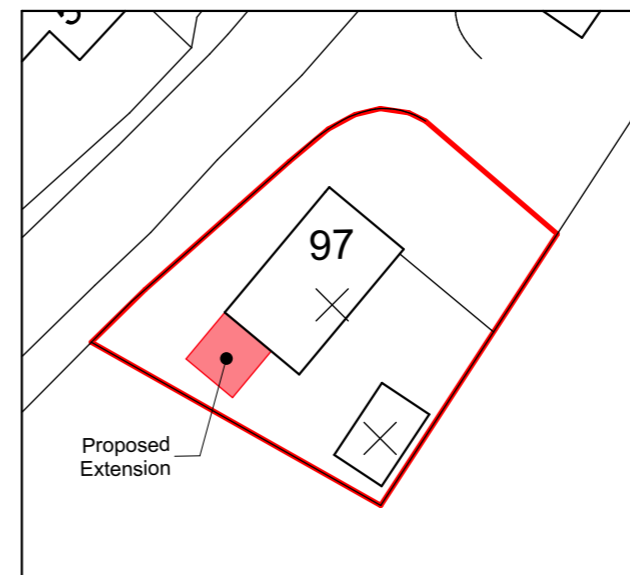
Proposed Block Plan 1:500