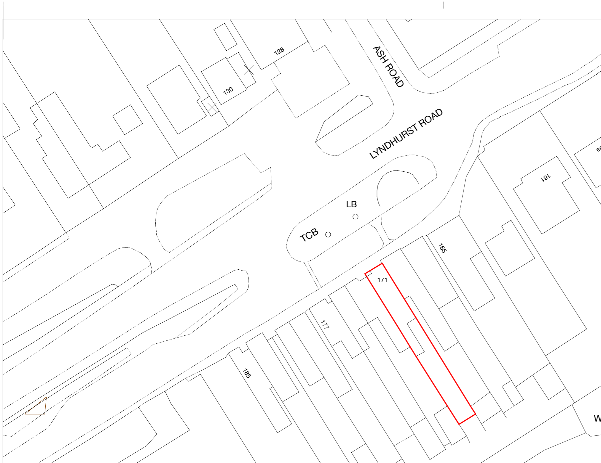
Proposed Block Plan