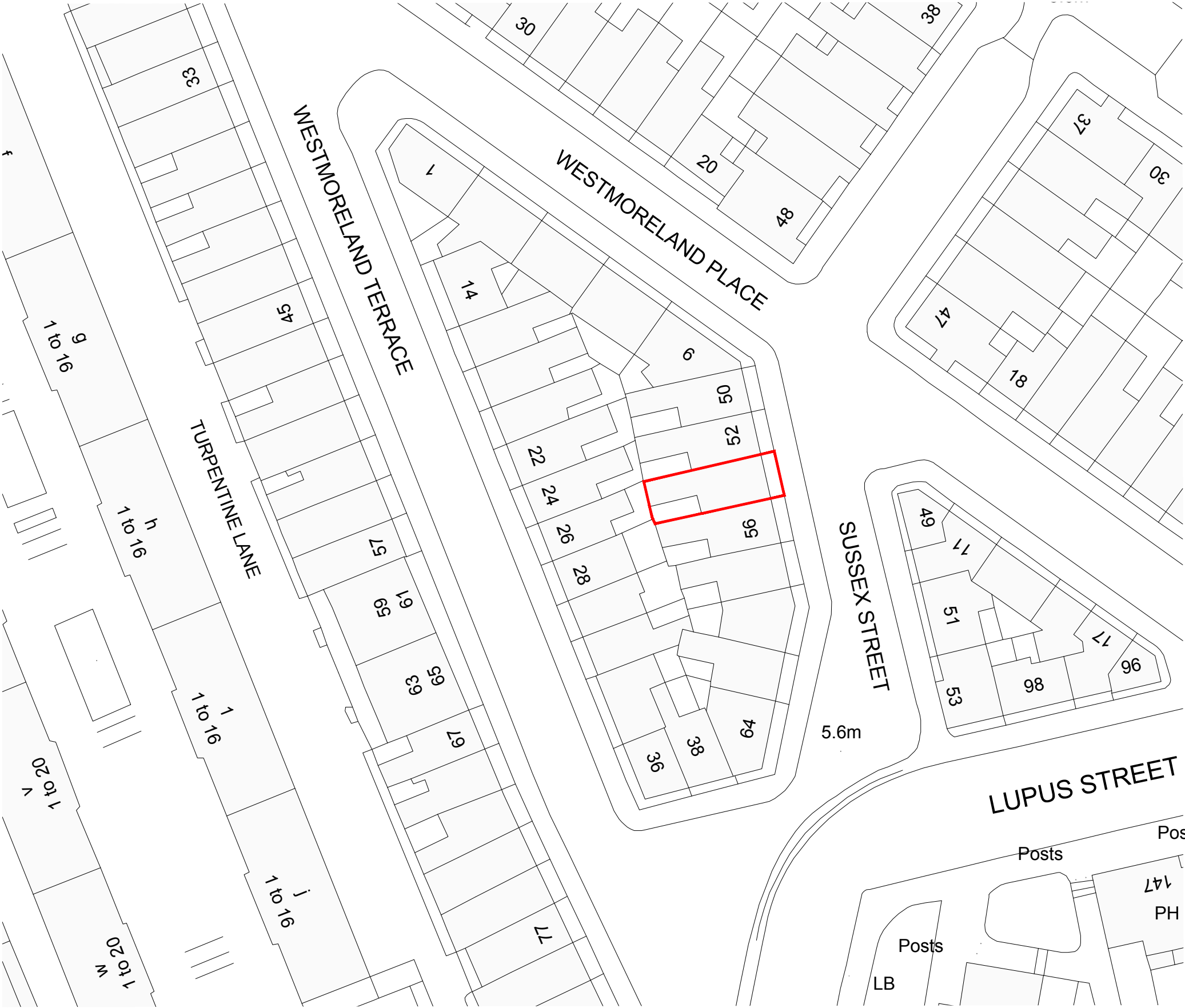
01 SITE PLAN SCALE 1:500 @ A3