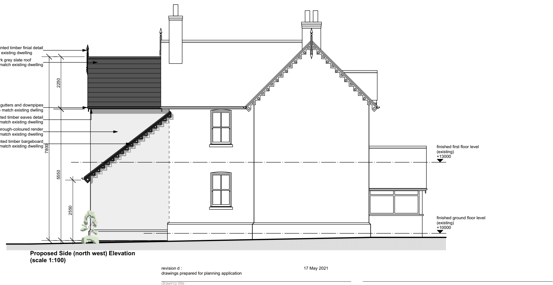
Proposed Side (north west) Elevation (scale 1:100)

revision d : 17 May 2021 drawings prepared for planning application