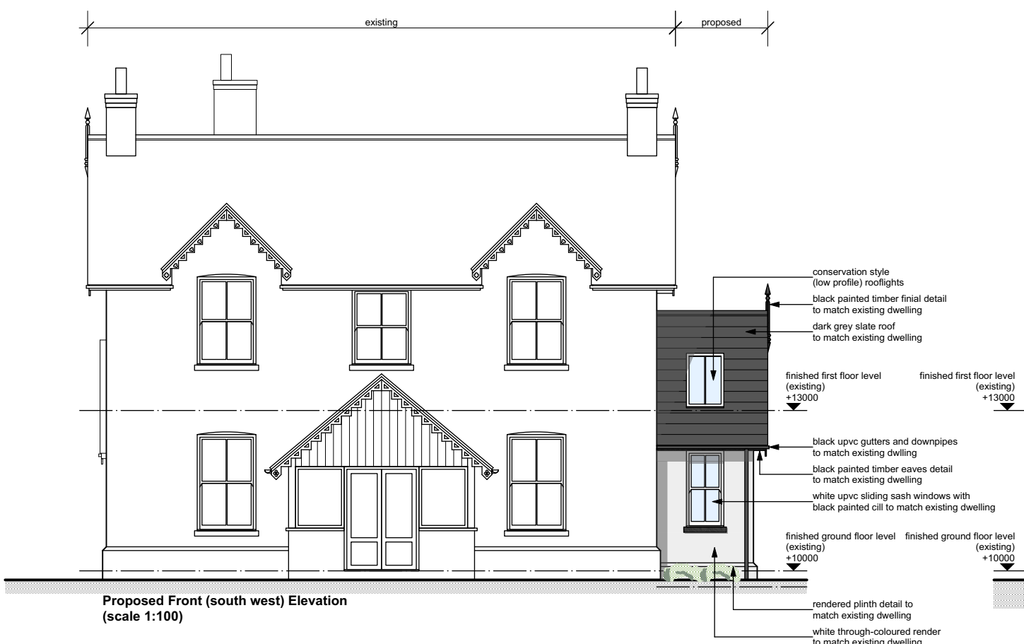
Proposed Front (south west) Elevation (scale 1:100)