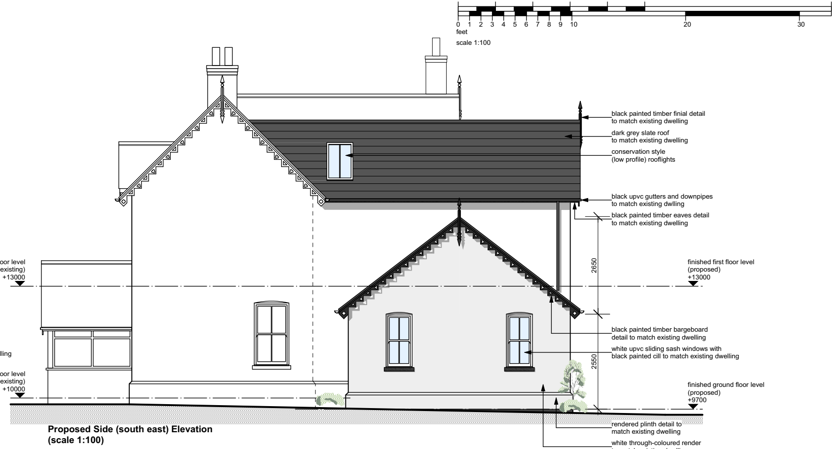
Proposed Side (south east) Elevation (scale 1:100)