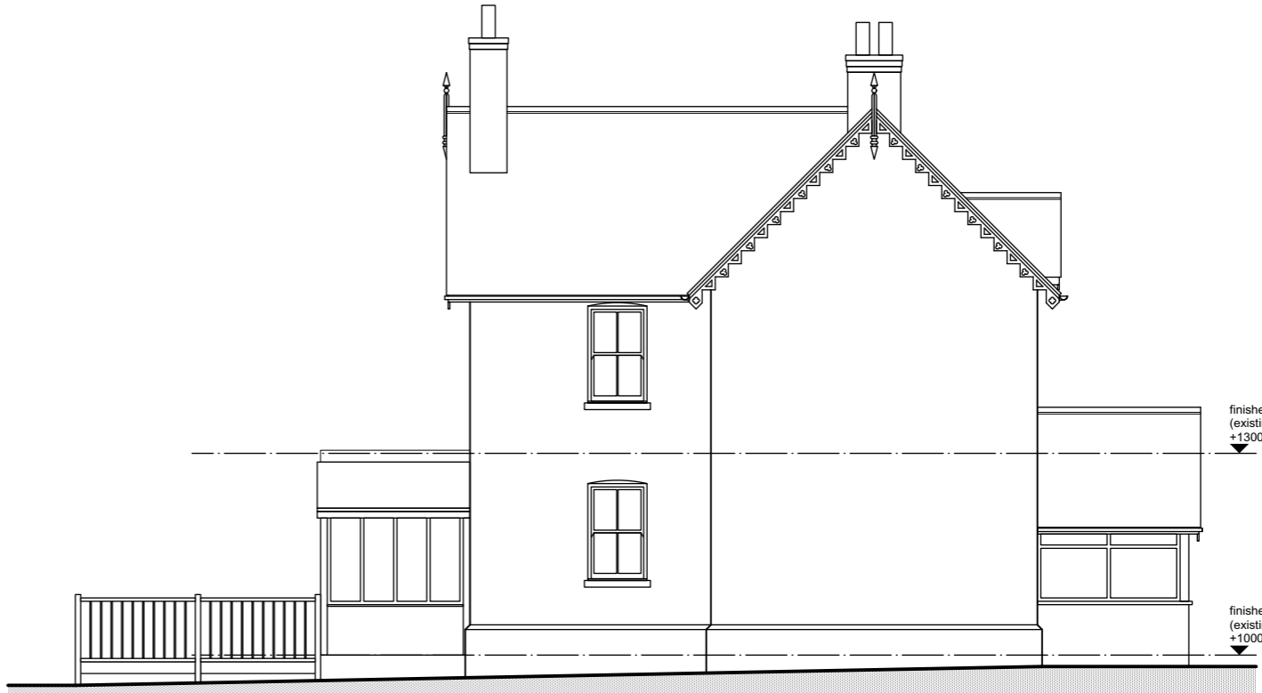
Existing Side (north west) Elevation (scale 1:100)

finished ground floor level (existing) +9850