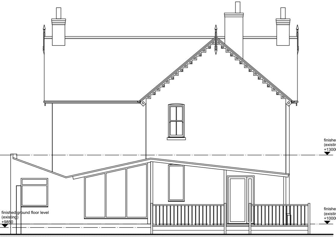
Existing Rear (north east) Elevation (scale 1:100)

finished first floor level (existing) +13000 finished ground floor level (existing) +9850