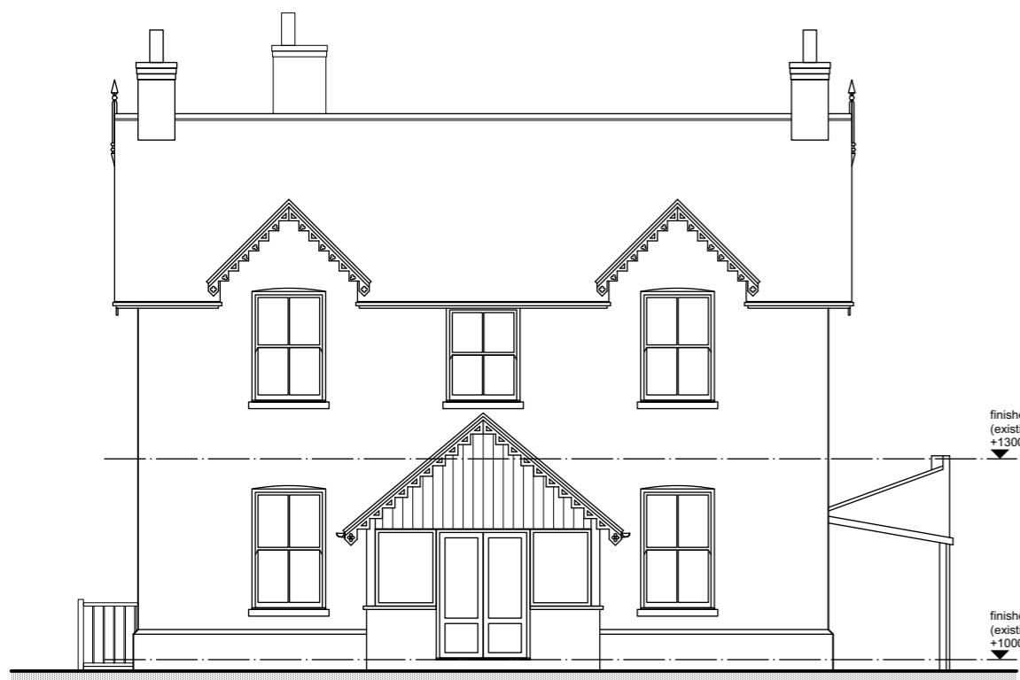
Existing Front (south west) Elevation (scale 1:100)

finished first floor level (existing) +13000 finished ground floor level (existing) +10000