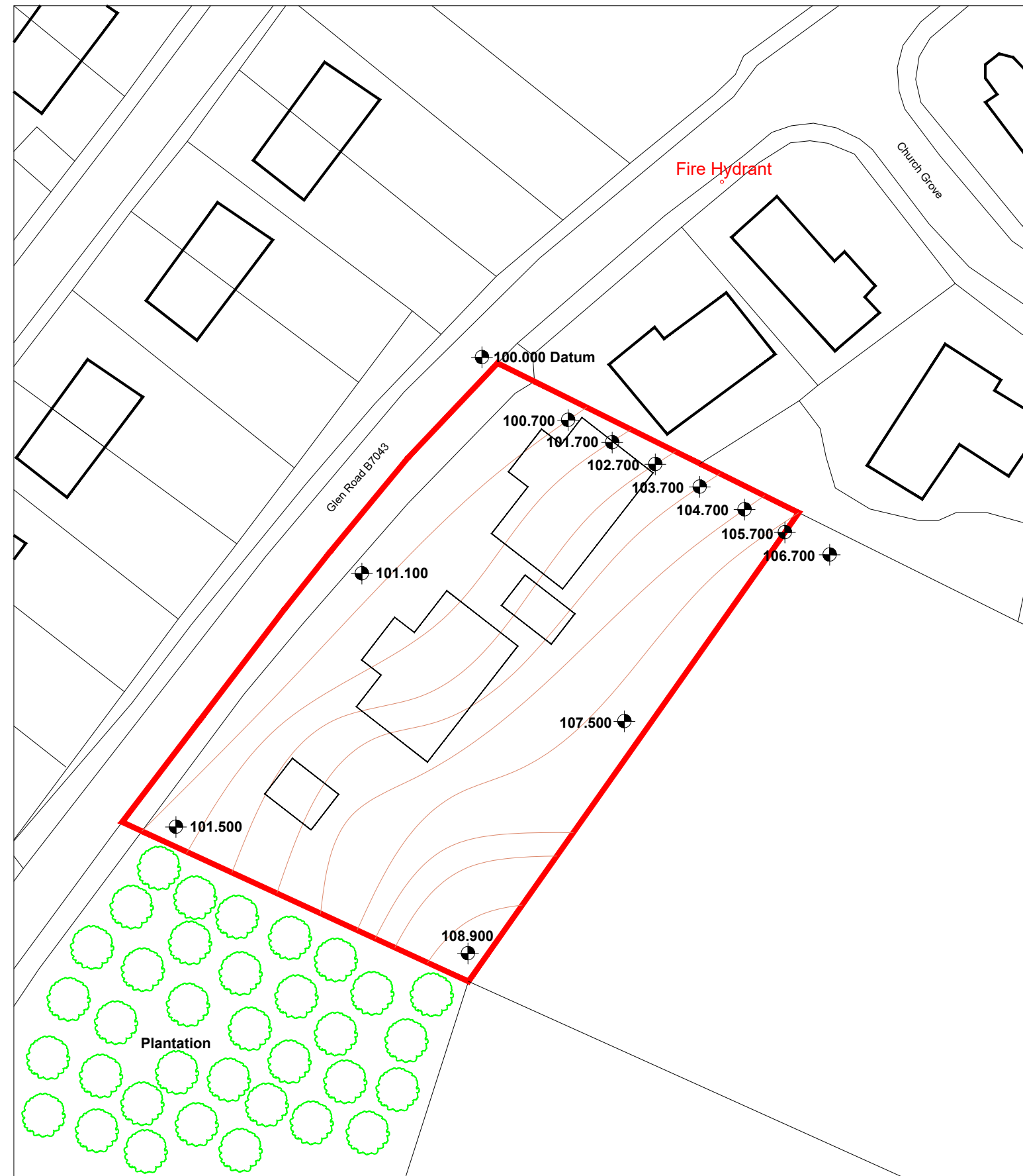
Site Plan Scale 1:500

Datum Point taken from the existing road edge (corner of site)