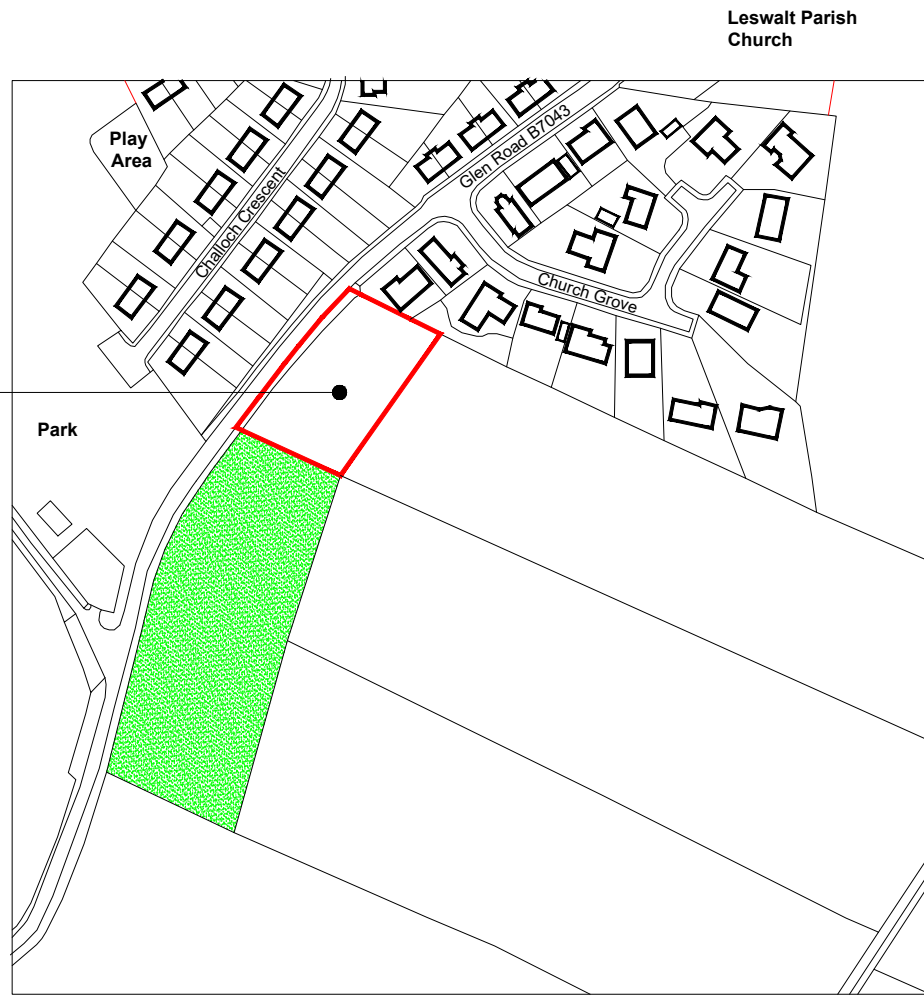
Location Plan Scale 1:2500