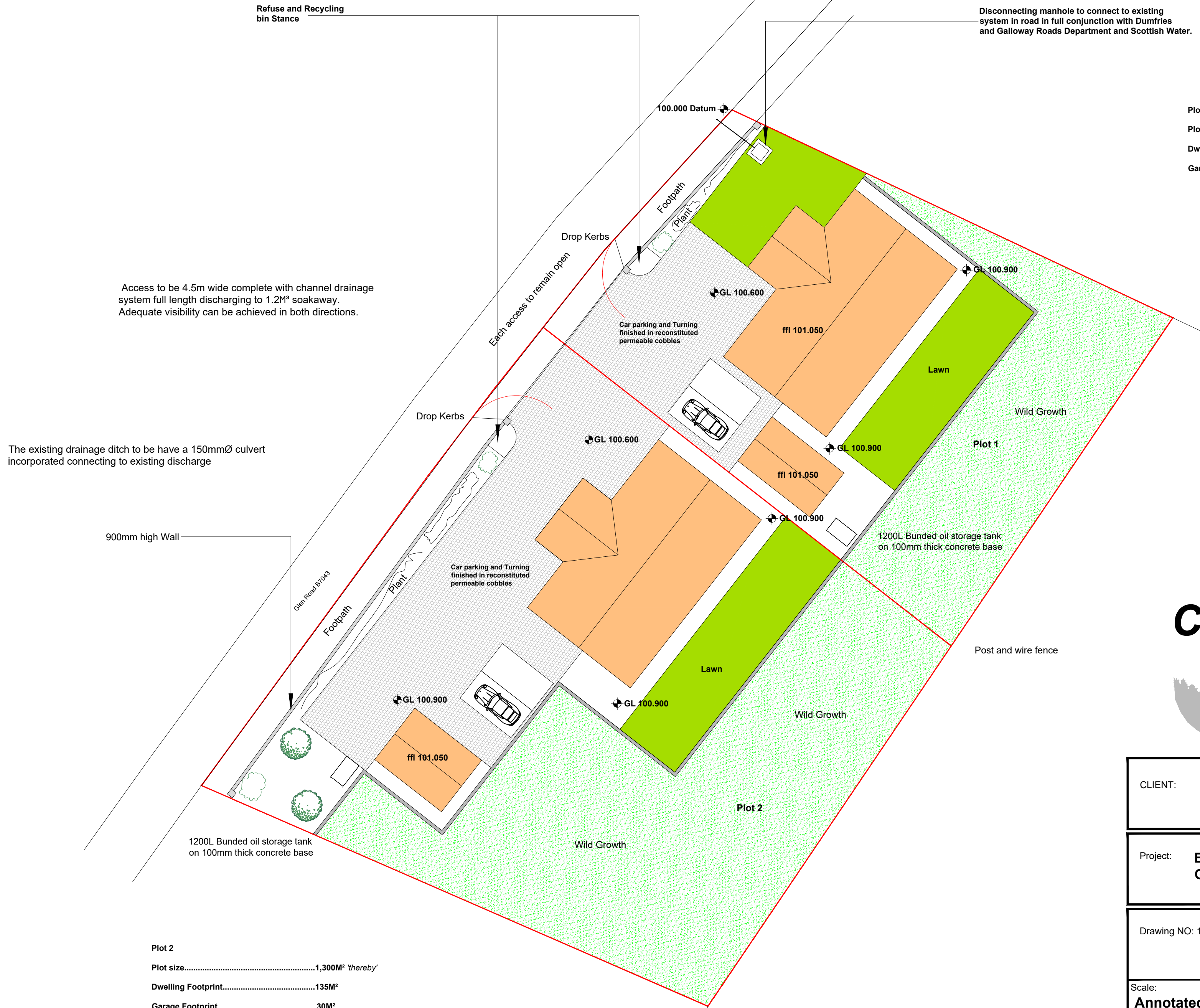
Site Plan Scale 1:200

Plot 1 Plot size.....900M 2 'thereby' Dwelling Footprint.....135M 2 Garage Footprint.....28M 2