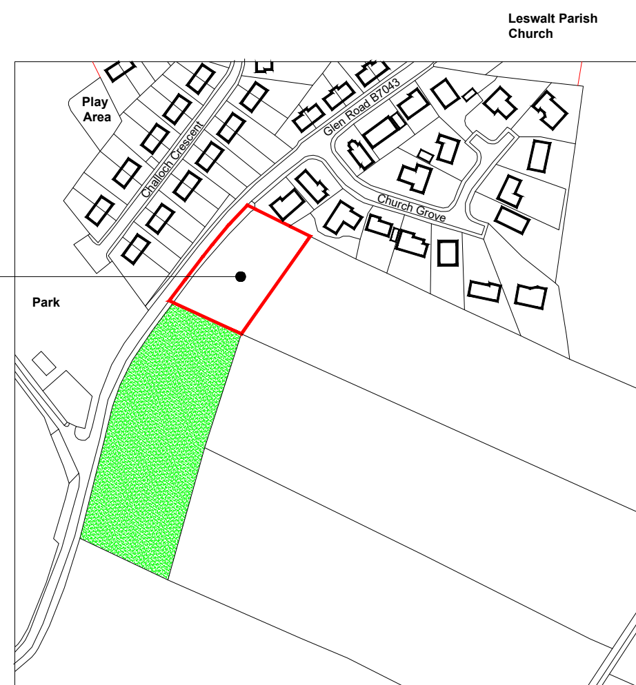
Location Plan Scale 1:2500