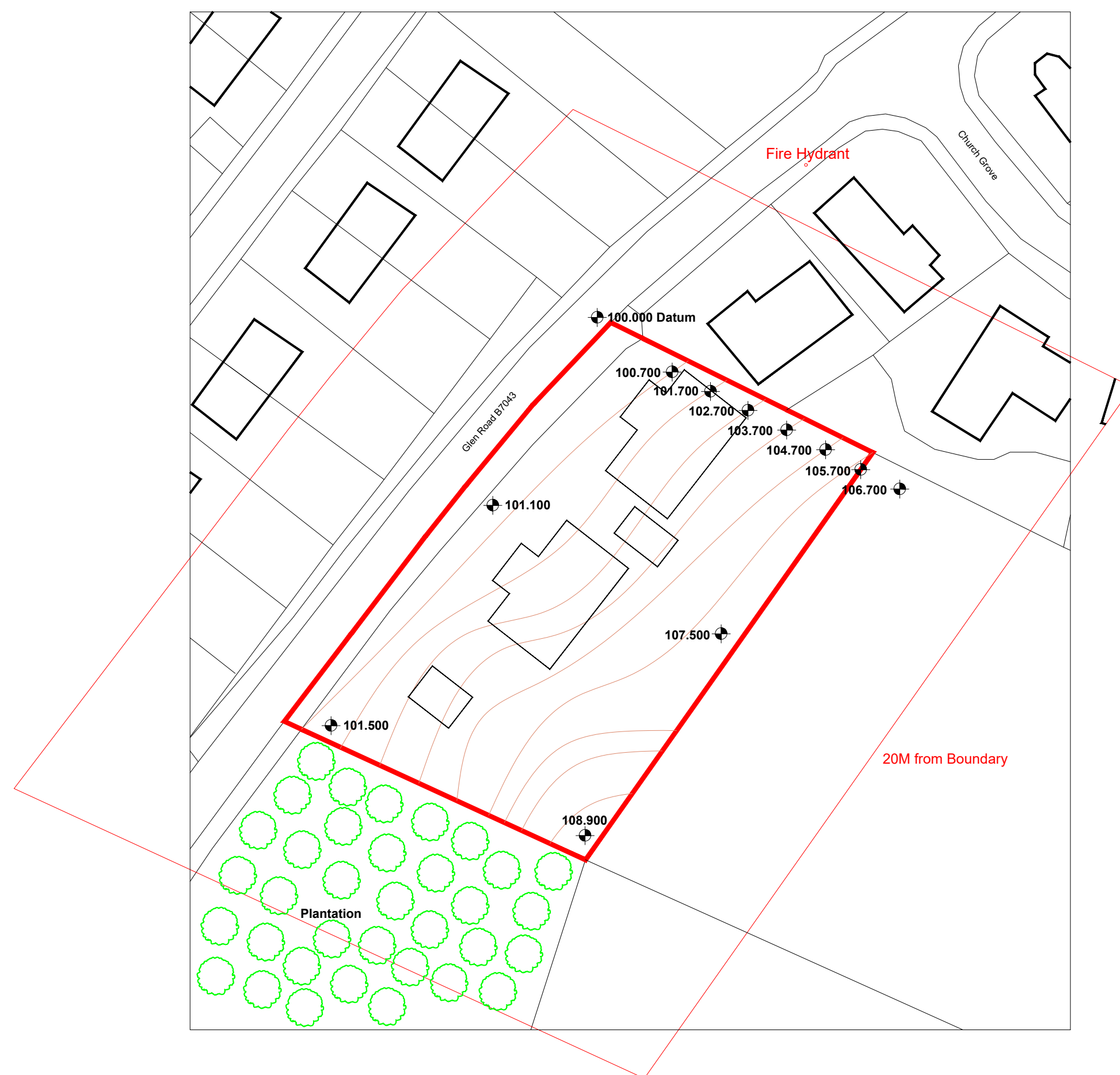
Site Plan Scale 1:500

Datum Point taken from the existing road edge (corner of site)