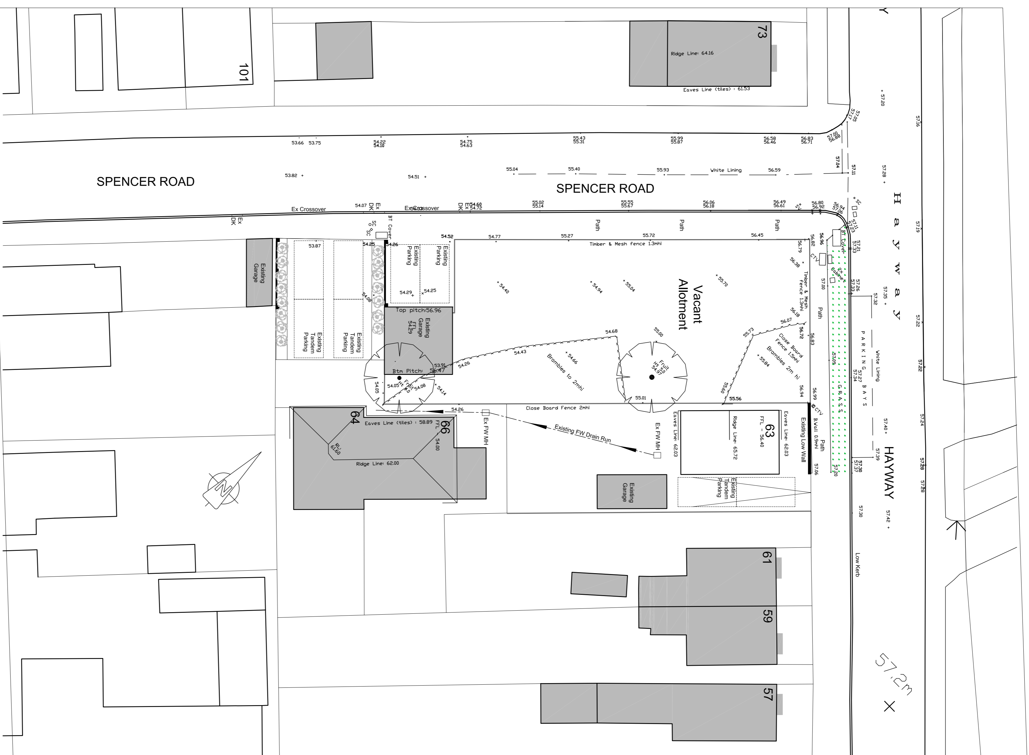
Existing Site Plan (Including Topographical Levels) Scale 1:200