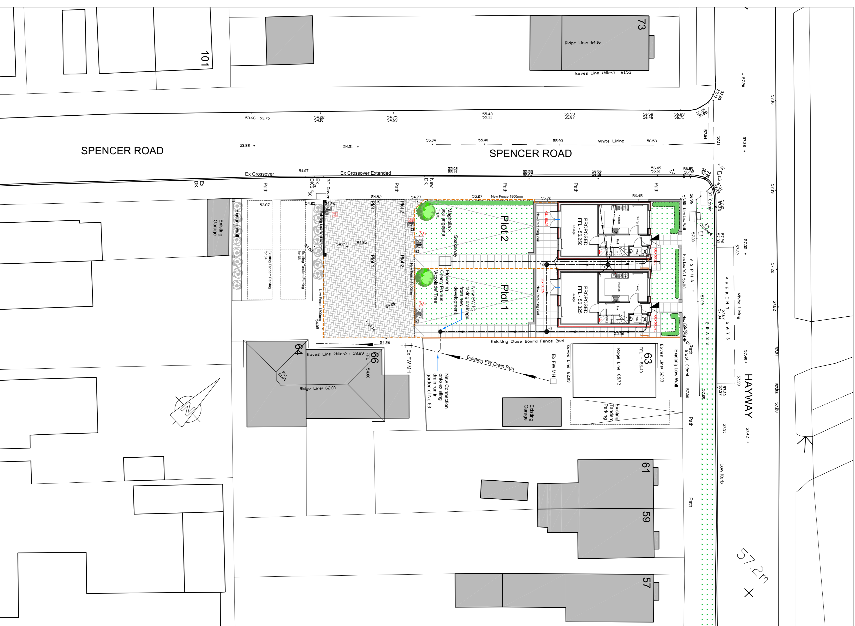
Proposed Site Plan Scale 1:200