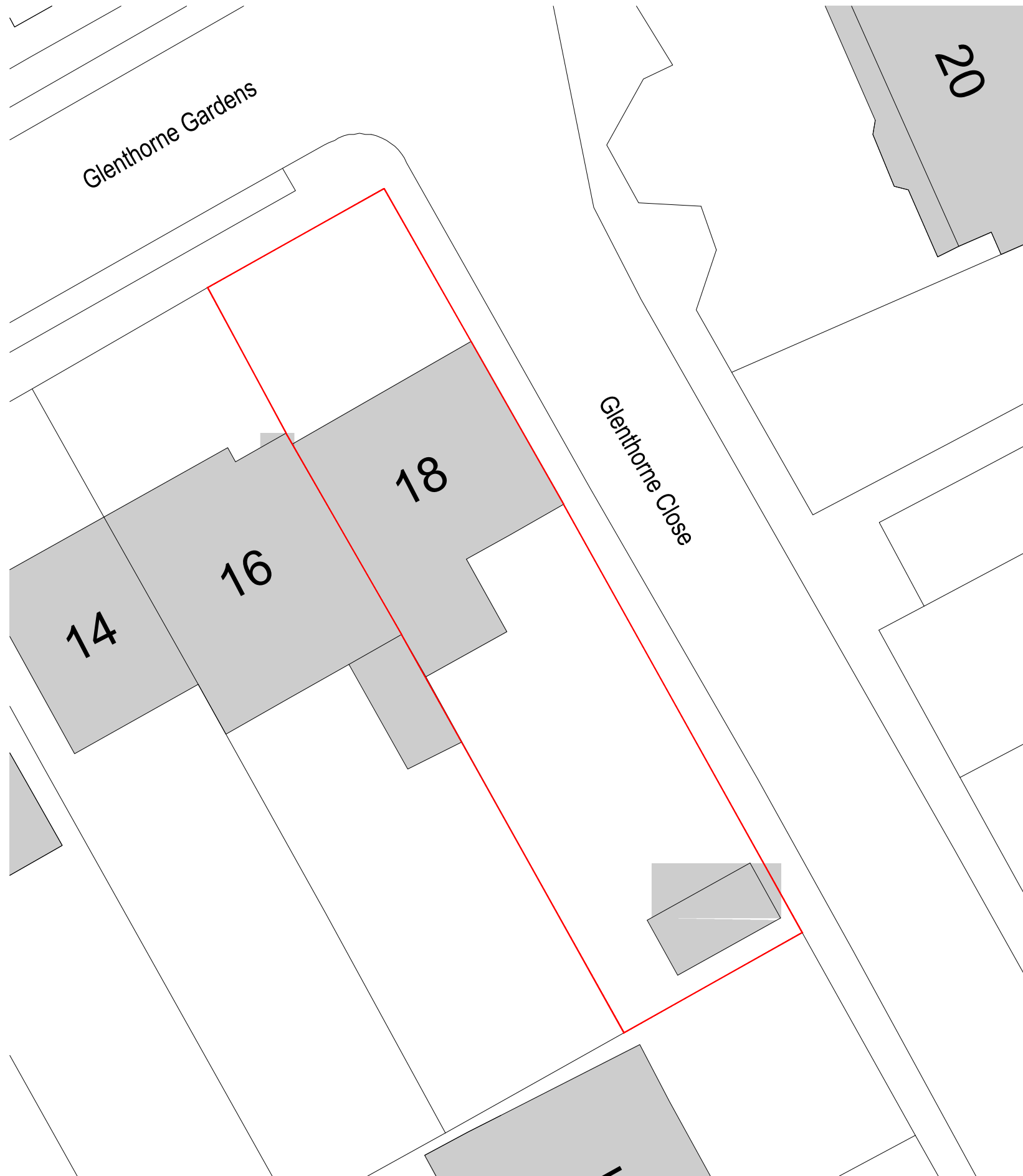
EXISTING BLOCK PLAN 1:1200