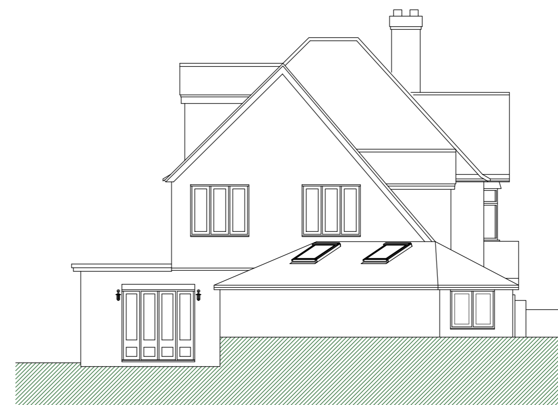
PROPOSED SIDE/NORTH ELEVATION