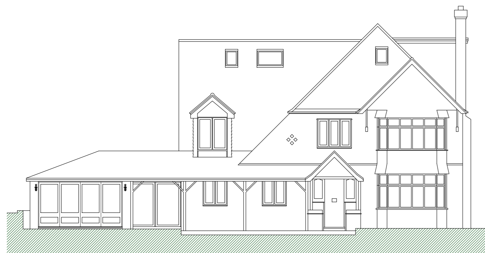
PROPOSED FRONT/WEST ELEVATION