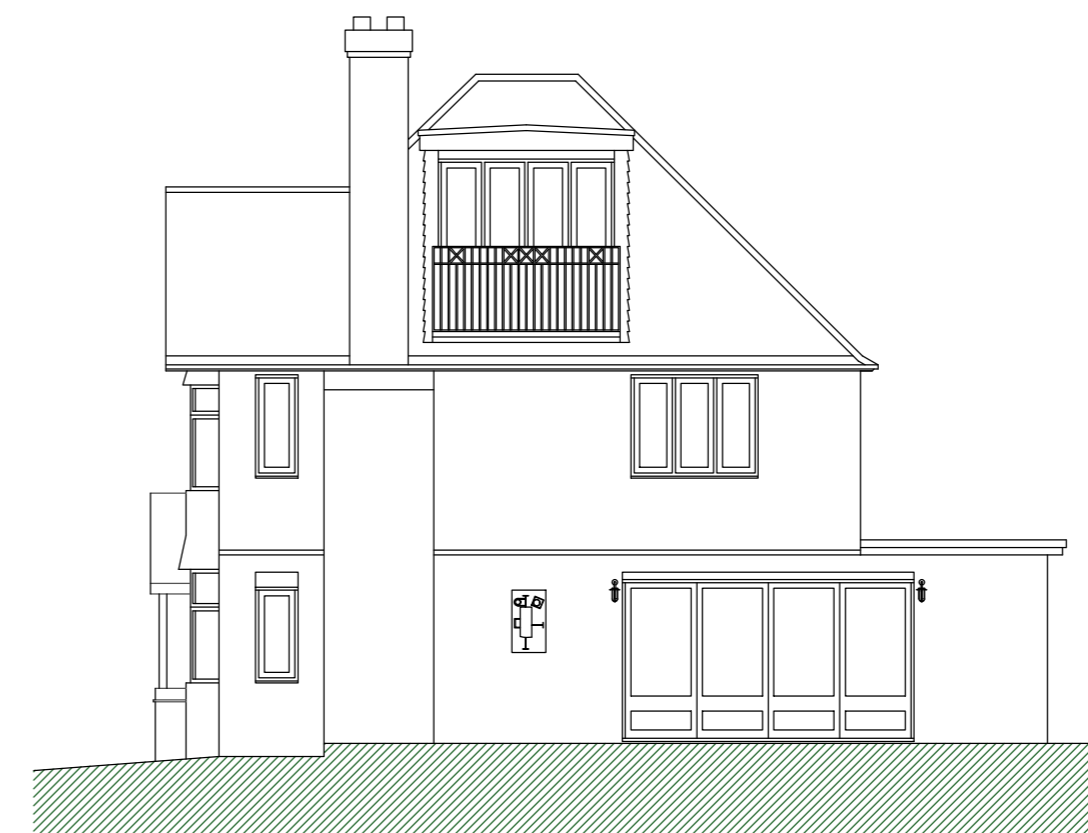
EXISTING SIDE/SOUTH ELEVATION