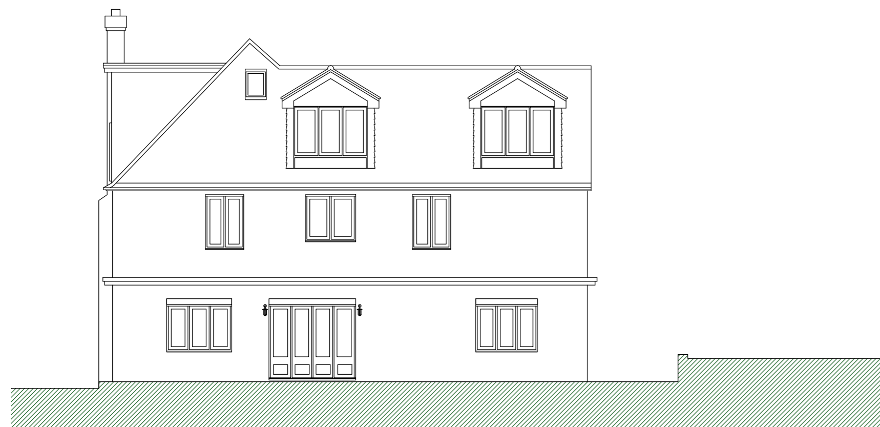
EXISTING REAR/EAST ELEVATION