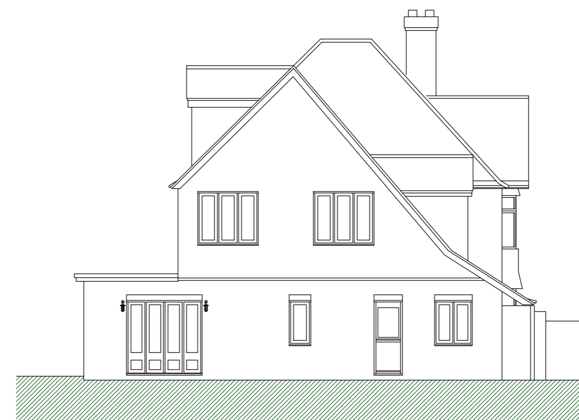
EXISTING SIDE/NORTH ELEVATION