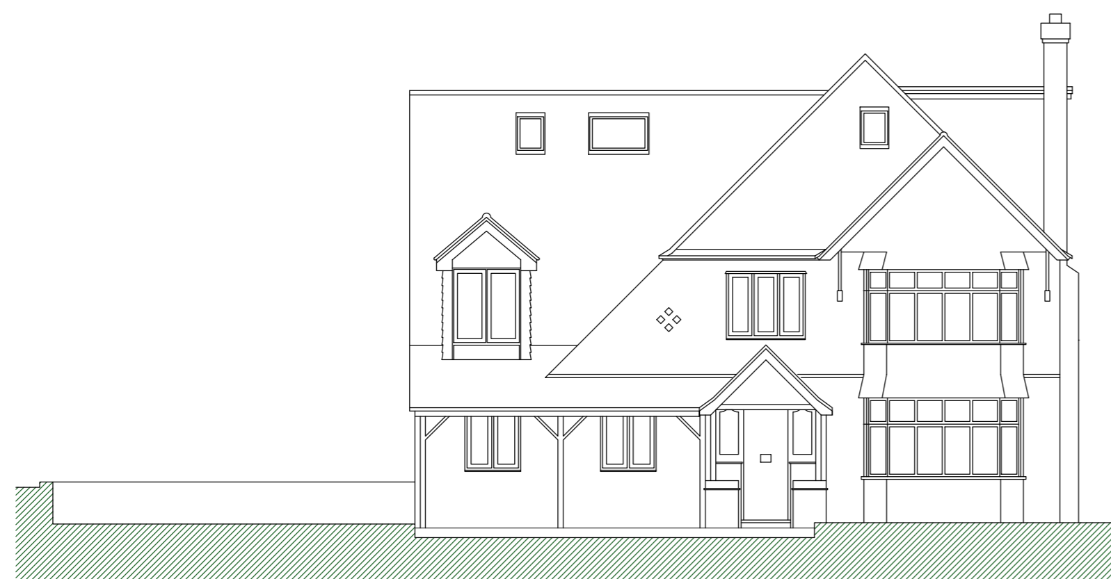
EXISTING FRONT/WEST ELEVATION