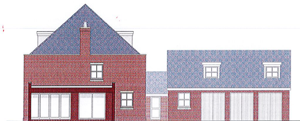
Side Elevation As proposed, 1:100

C 02.11.15 Client's amendments B 05.10.15 Client's amendments Revs: A 23.06.15 Chimneys added