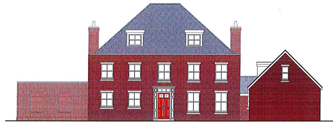
Front Elevation As proposed, 1:100