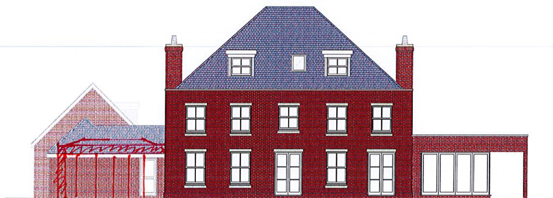
Rear Elevation As proposed, 1:100

Brick - Matching - with window - Flat roof and glass dome.