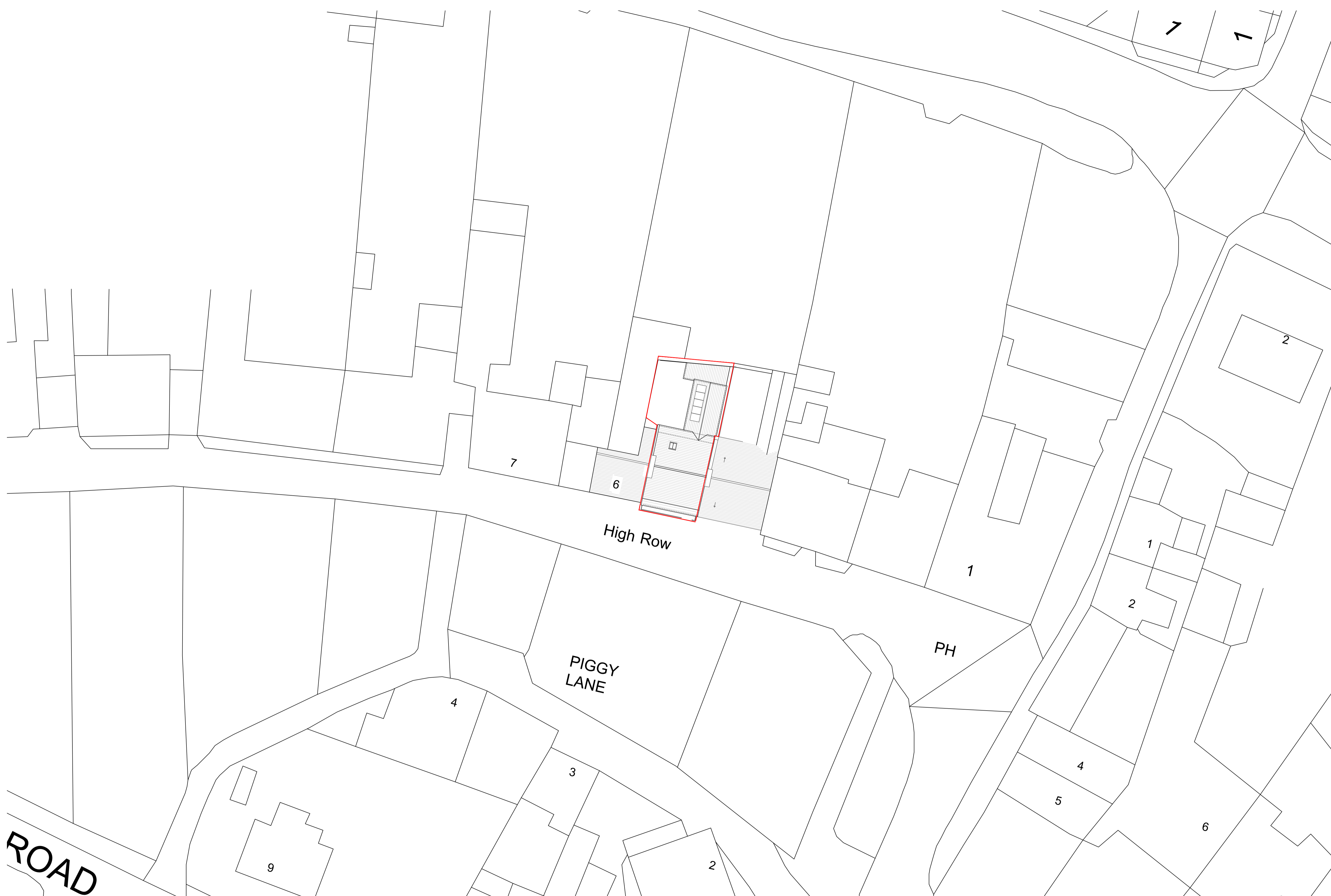
Proposed Site Plan with Roof Plan