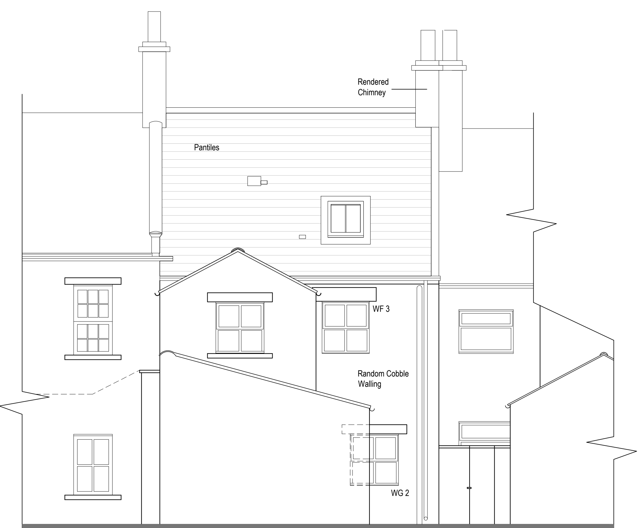
Existing North Facing Elevation