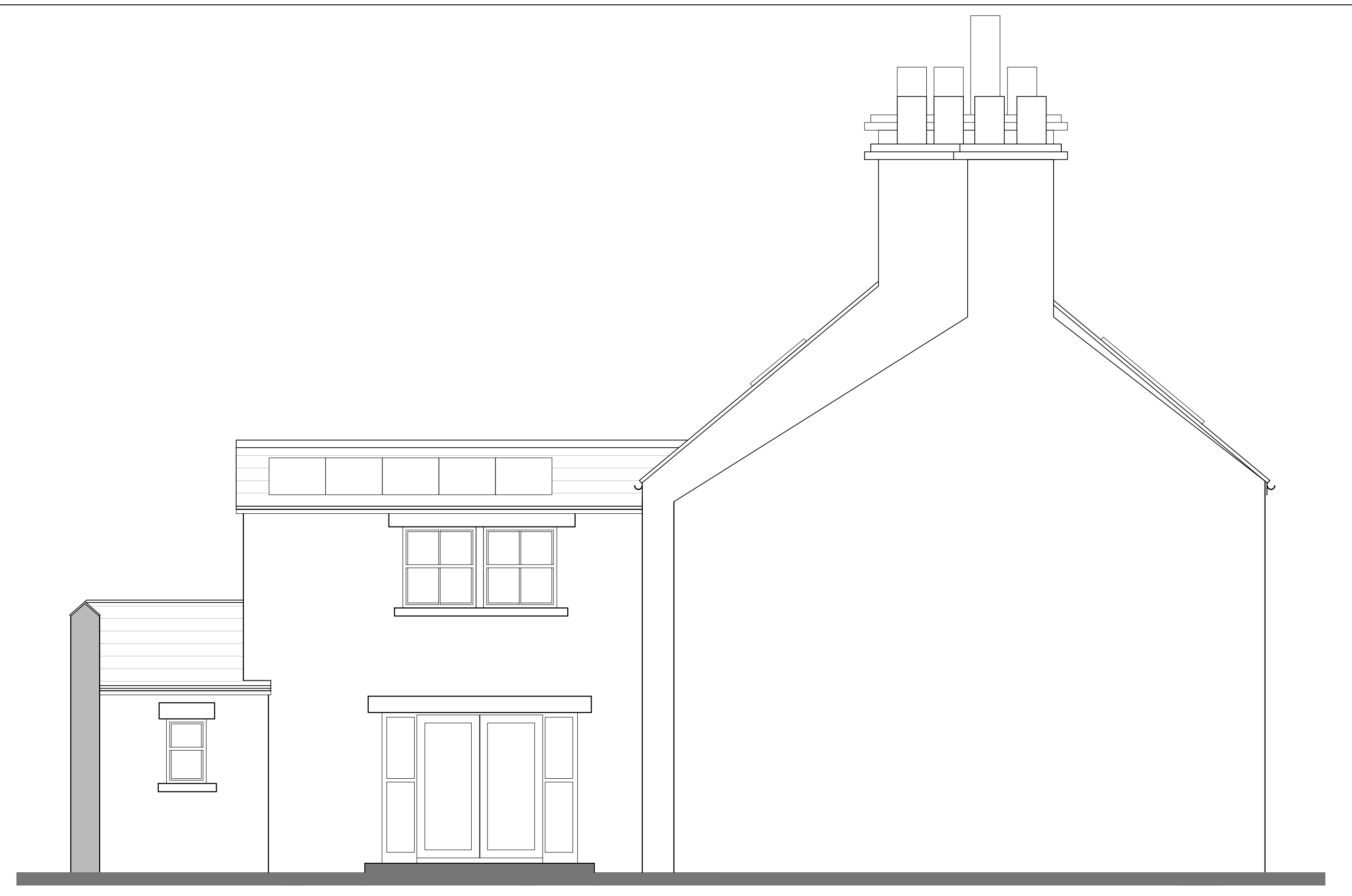
Existing West Facing Elevation