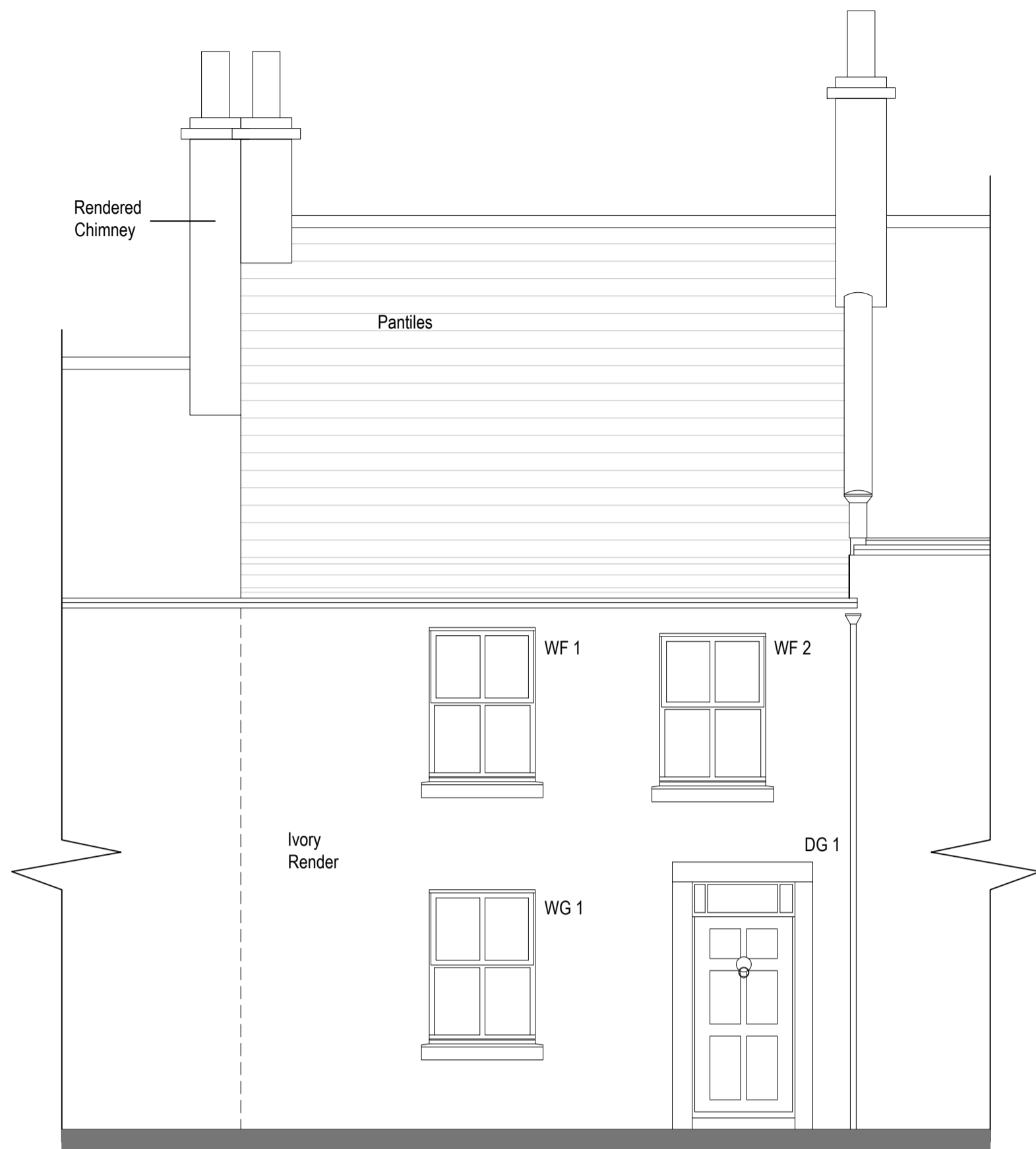
Existing South Facing Elevation

NOTES Do not scale this drawing. All dimensions are in millimetres unless stated otherwise. This drawing is to be read in conjunction with all other relevant drawings and specifications. The copyright of this drawing is vested in Harris Irwin Associates Ltd and must not be copied or reproduced without the written consent of a Director.