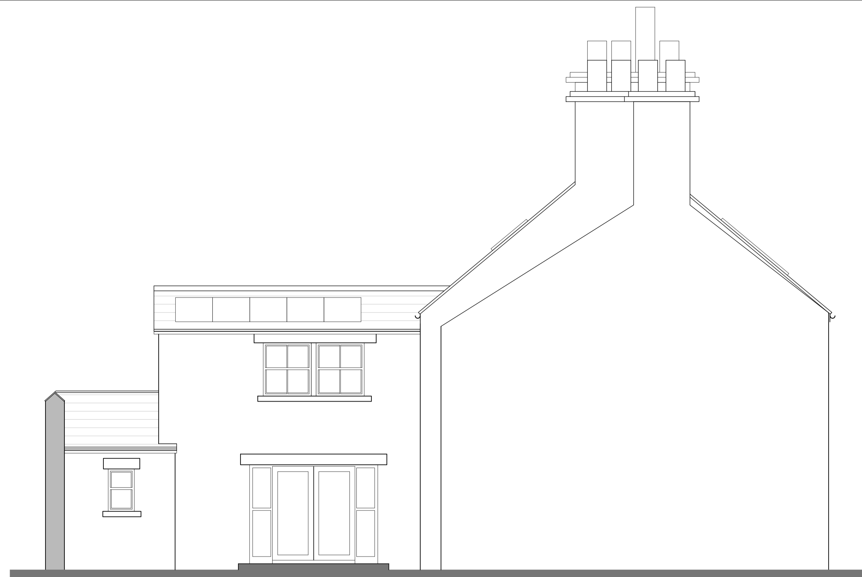
Existing West Facing Elevation