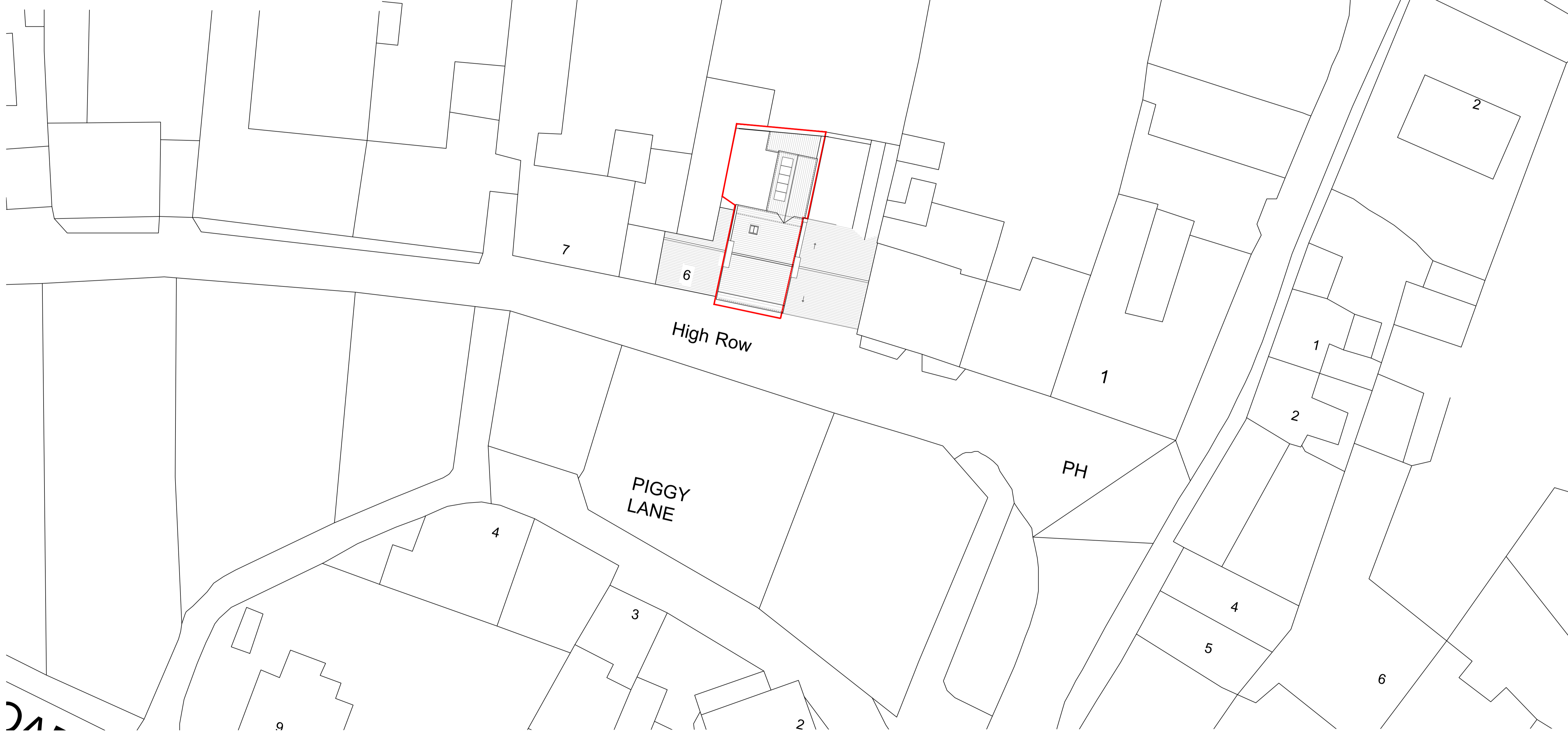
Existing Site Plan with Roof Plan 1:200 @ A1