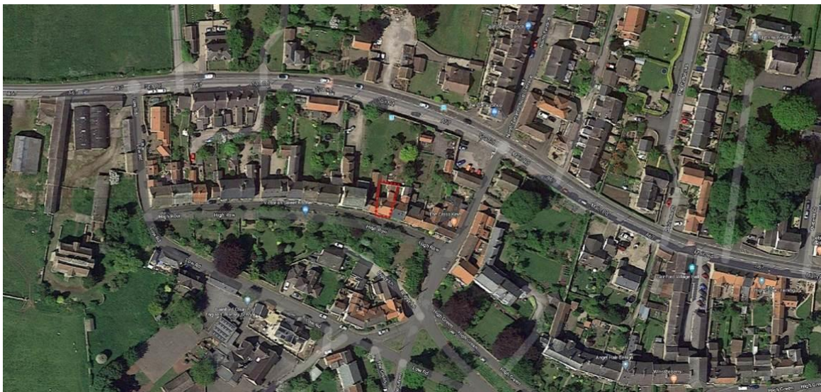
The below image is a current aerial view of Gainford.