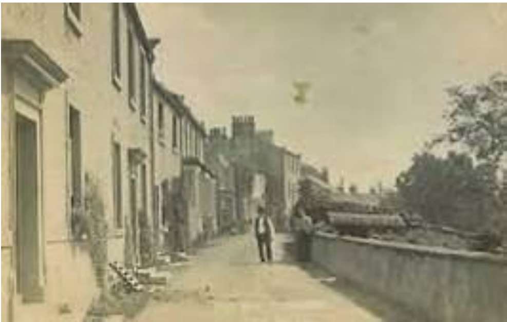
Historical Photographs of High Row facing east and west above and below

house or if your purse could stretch to it the whole house and garden walls as shown on the historical photos below. This altered the Georgian houses to the latest fashion, the equivalent of pebble dashing in the 1970s.