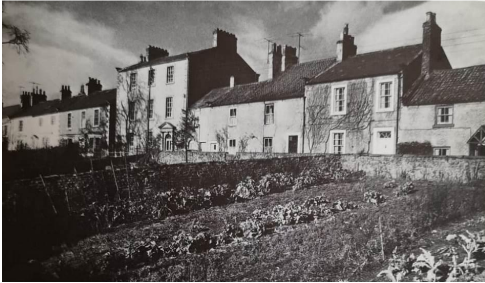
High Row Gardens 1971