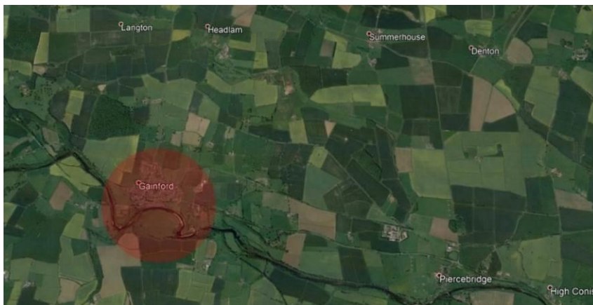
Aerial View of Gainford in relation to surrounding villages

Gainford is a village on the north bank of the River Tees in County Durham. It lies approximately 11km west of Darlington and 14.5km east of Barnard Castle on rising ground on the north bank of the River Tees.