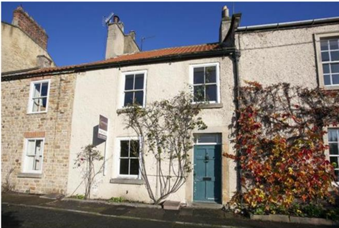
View of No.5 House High Row September