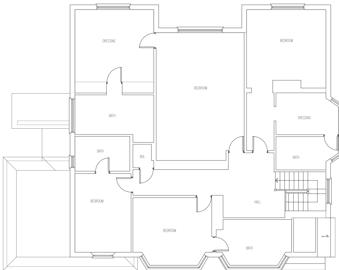
EXISTING FIRST FLOOR PLAN 1:100