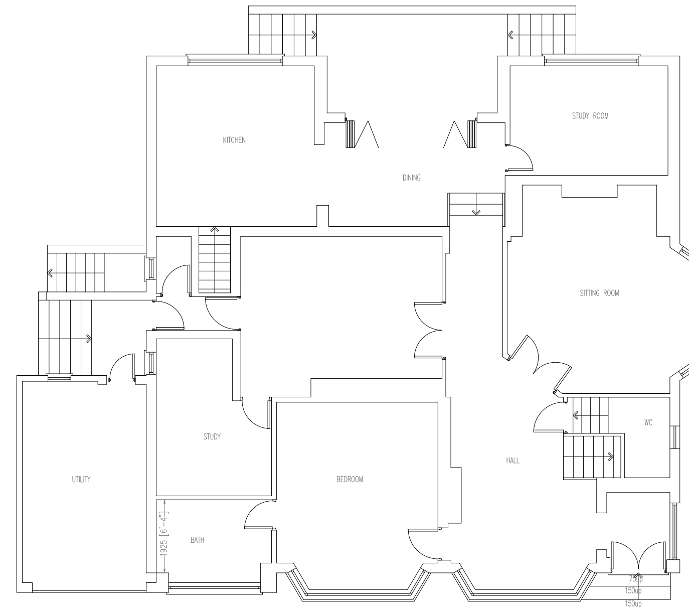
EXISTING GROUND FLOOR PLAN 1:100