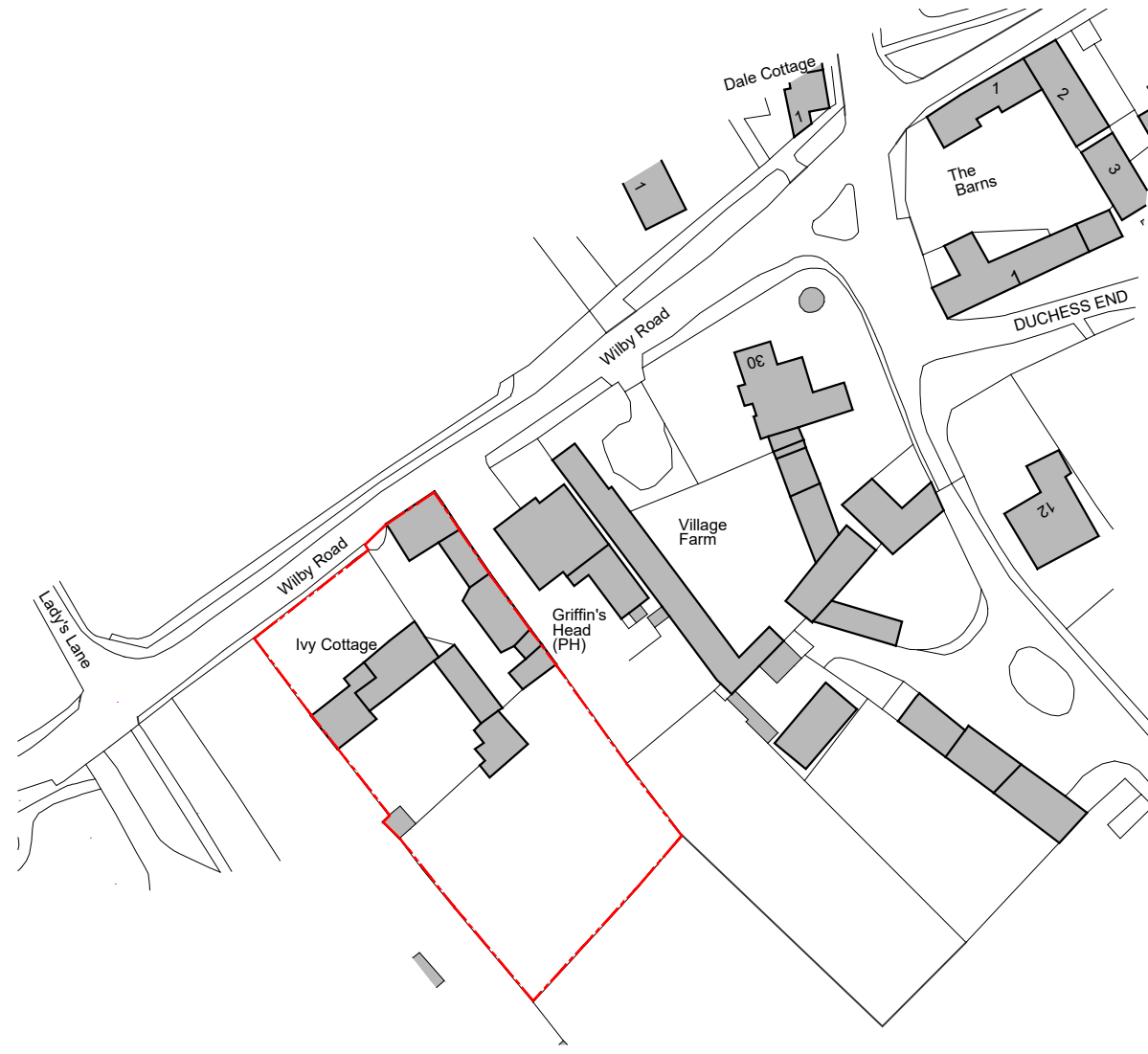
SITE LOCATION PLAN SCALE 1:1250 @A3

Copyright Statement The following copyright should accompany this product any time it is used. Ordnance Survey © Crown Copyright 2020. All rights reserved. Licence number 10002243