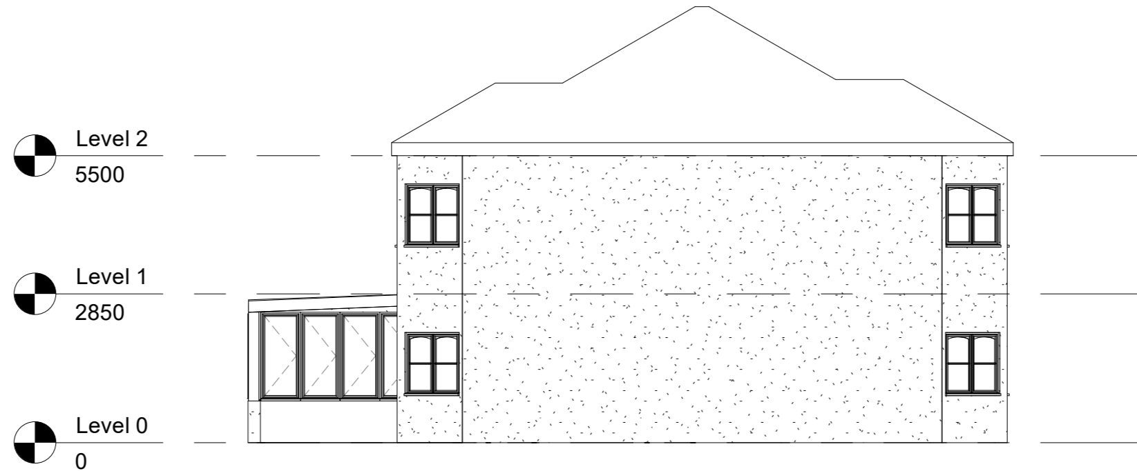
1 Existing Side Elevation (No 69 Side) 1 : 100