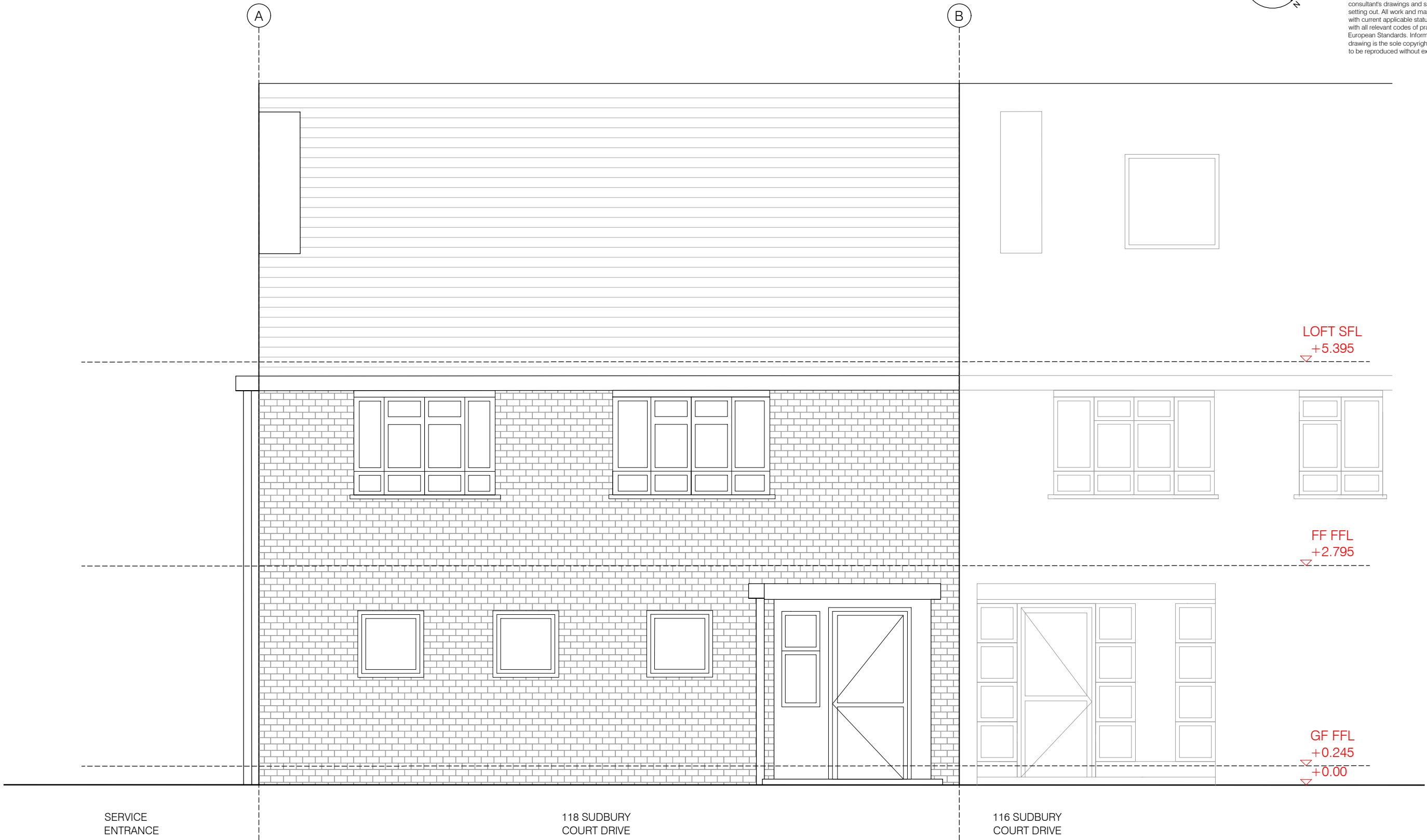
EXISTING NORTH-WEST (FRONT) ELEVATION