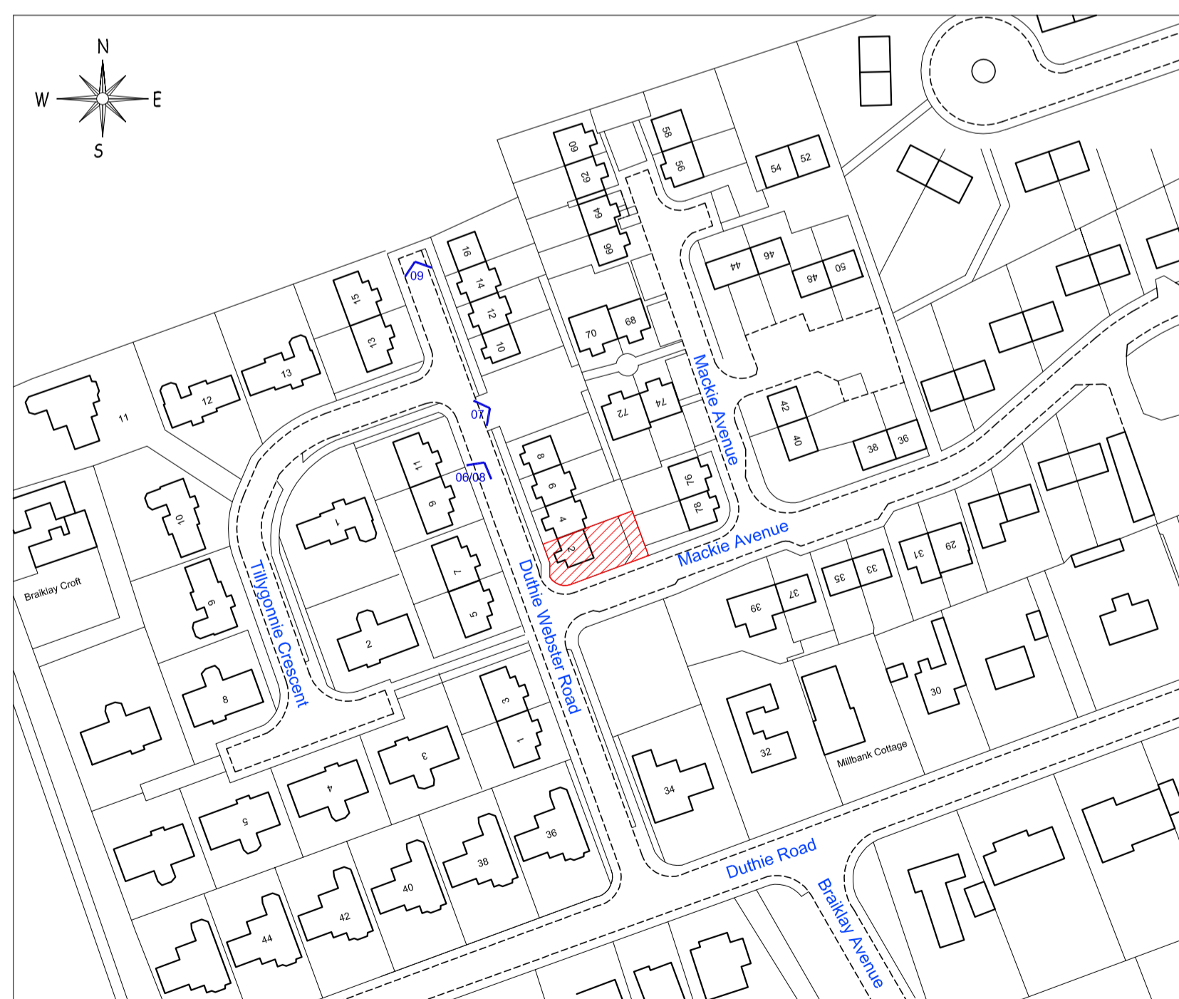
Proposed Location Plan Scale 1:1250