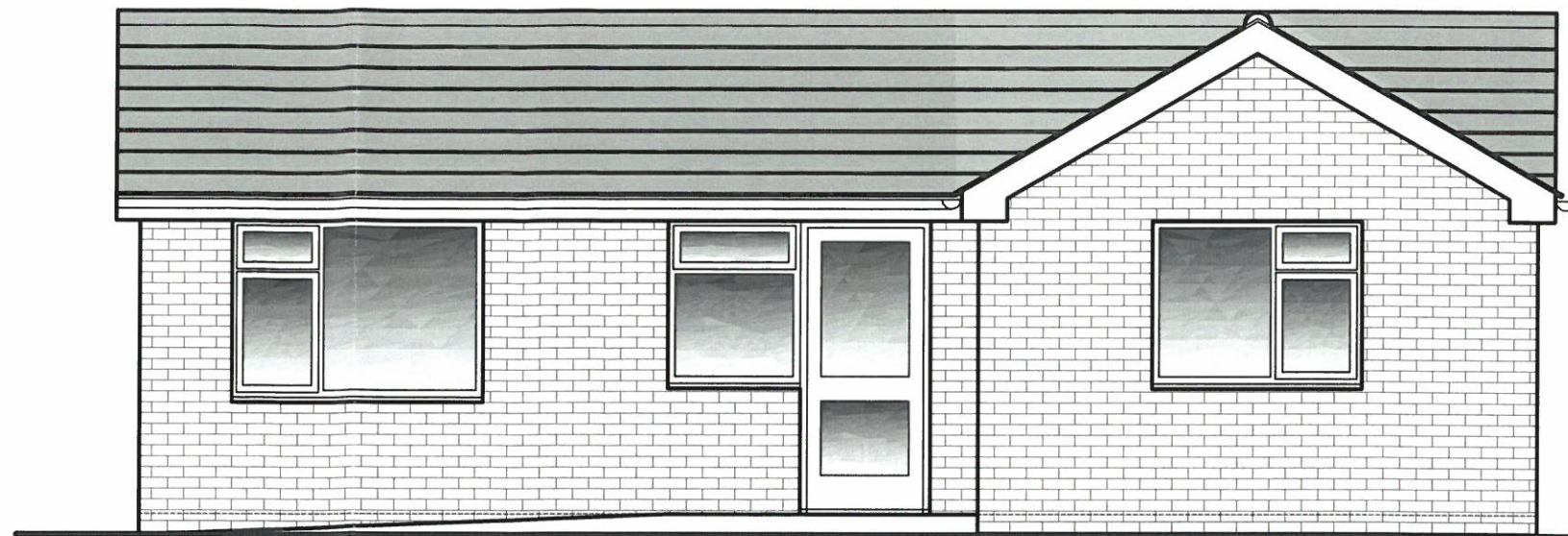
Proposed Side Elevation (East)