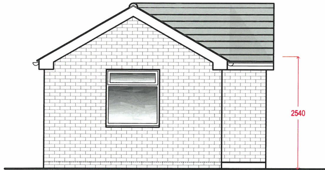
Proposed Front Elevation (South)