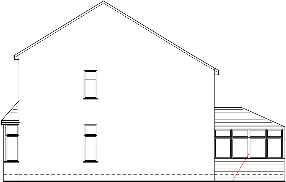
right (south east) elevation