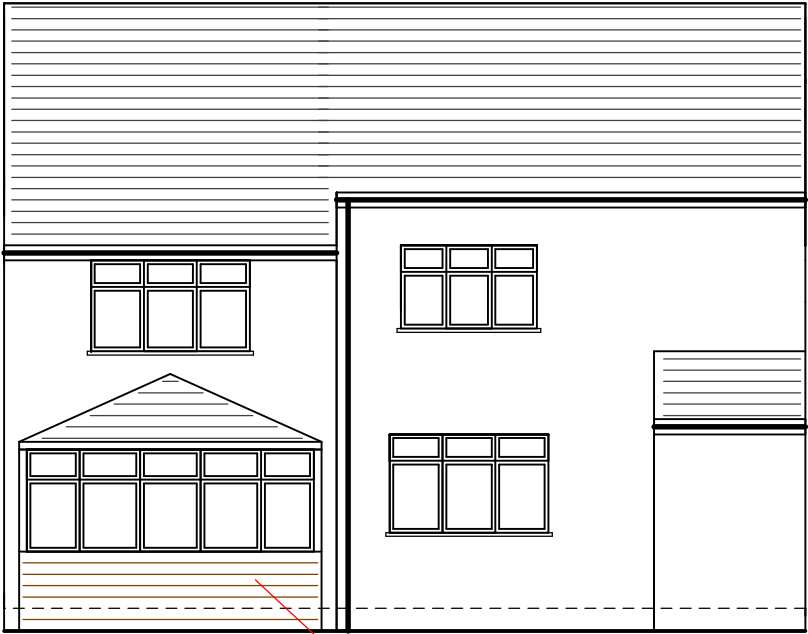
rear (north east) elevation