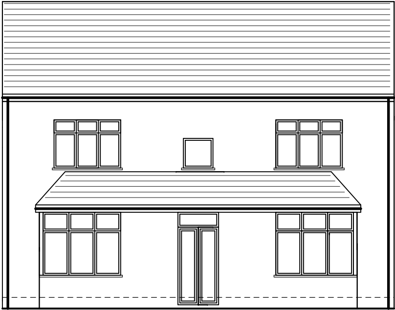
front (south west) elevation