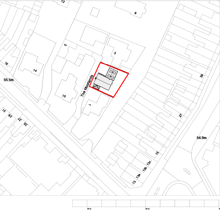
1 Location Map 1 : 1250

Title: 2 The Moorlands, Hayway, Rushden, NN10 6EU Map Produced for: Legah Architecture © Crown copyright and database rights 2021 OS 100042766 Project ID: Date of Purchase: 28-05-2021 1 Years subscription from 28-05-2021 for 1 workstation.