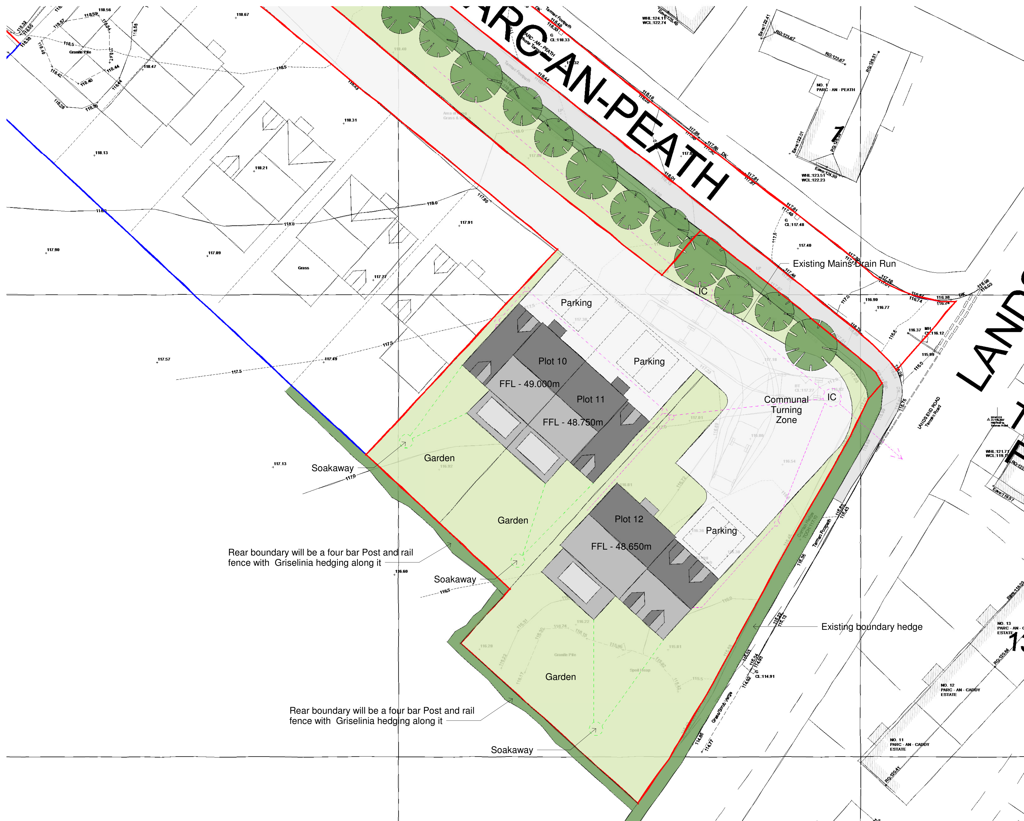
1 Proposed Enlarged Site Plan 1 : 200