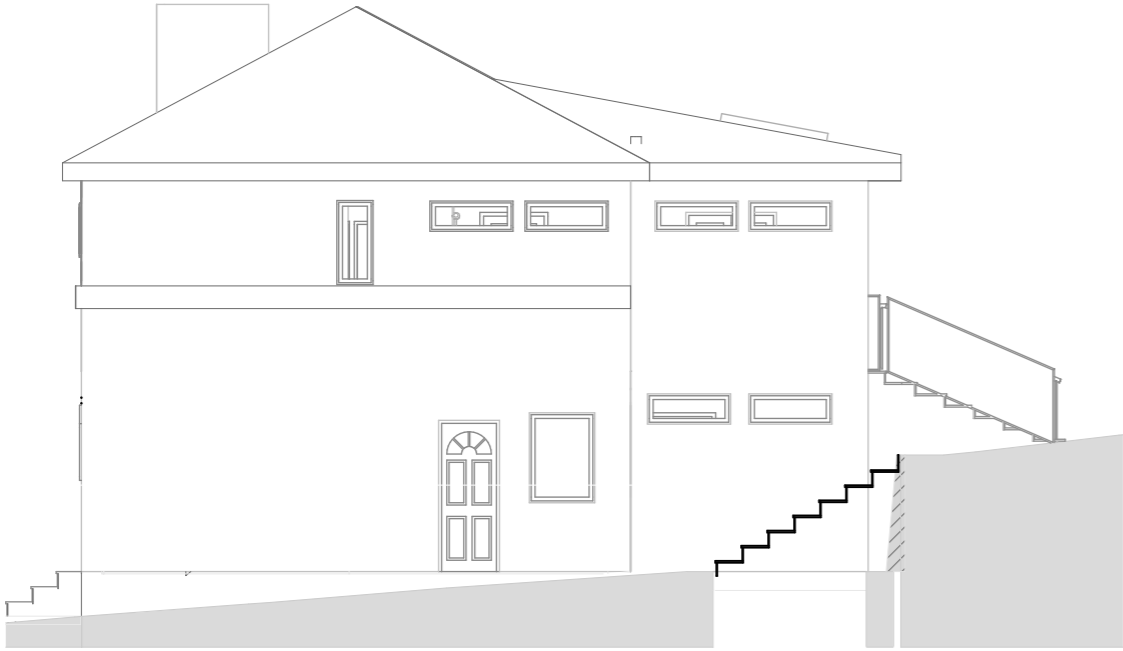
BVN.04.4 E-10 PROPOSED ELEVATION: SOUTH