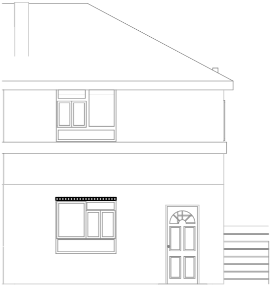
BVN.04.4 E-09 PROPOSED ELEVATION: WEST