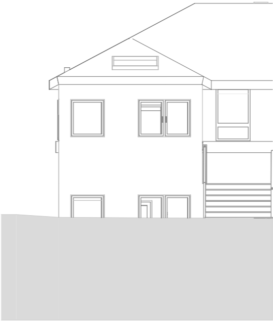
BVN.04.4 E-11 PROPOSED ELEVATION: EAST