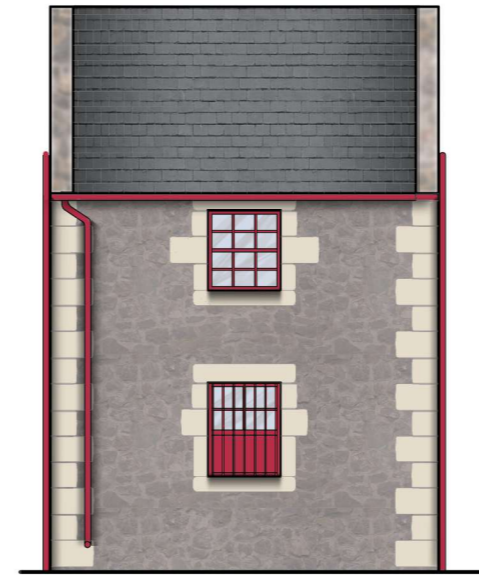
OUT HOUSE: NORTH ELEVATION