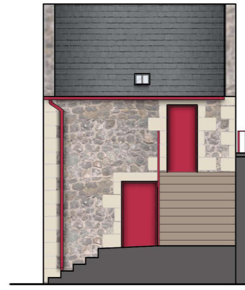
OUT HOUSE: SOUTH ELEVATION