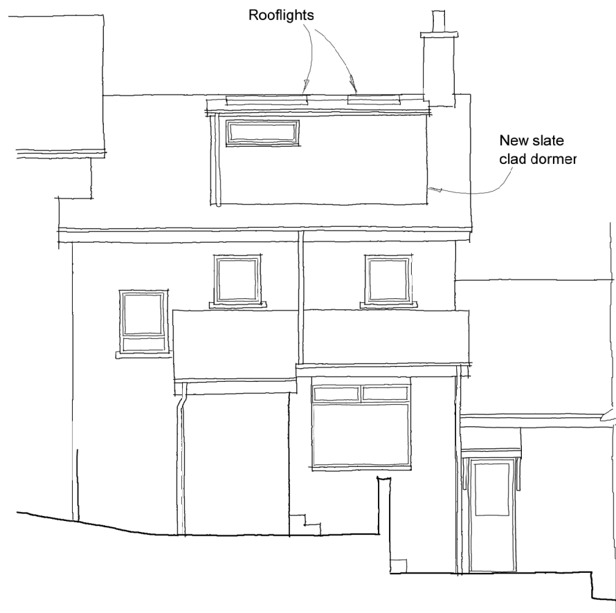
West (Rear) Elevation