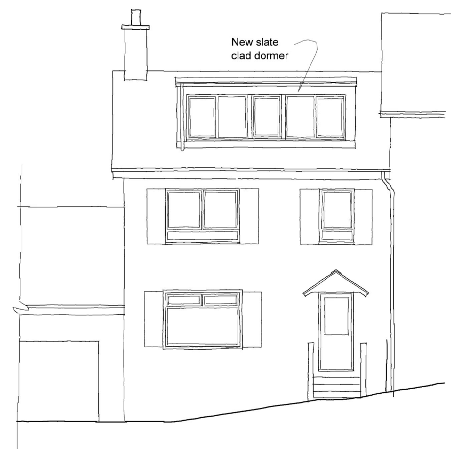
East (Road) Elevation

Materials: New Dormer walls - slate to match roof New windows - White to match existing New dormer roof - Black EPDM