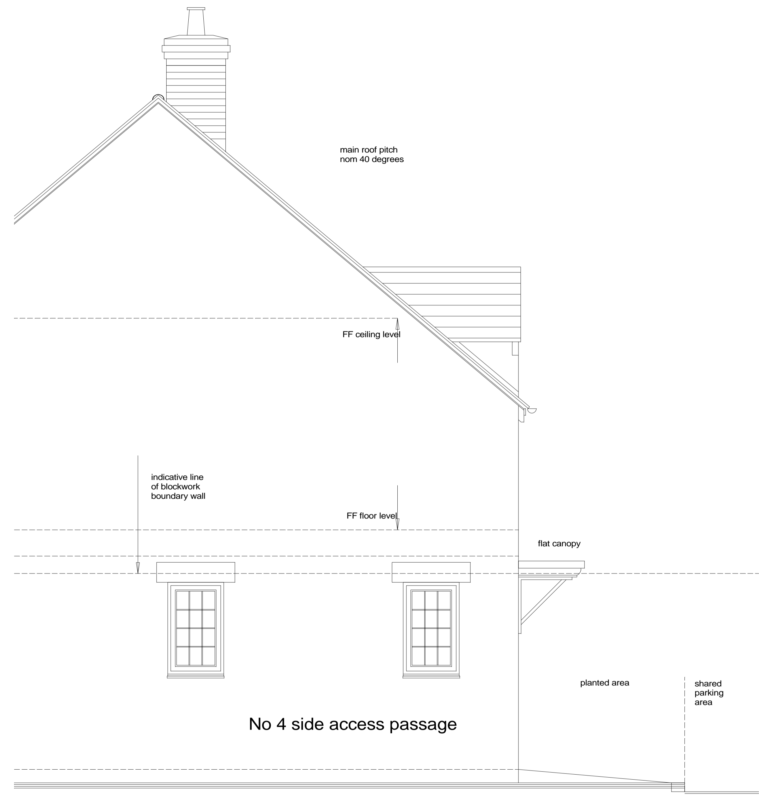
No 4 side access passage No 4 Millers Cottages Part Gable Elevation - see also dwg 102

Notes All dimensions must be checked on site & not scaled from this drawing