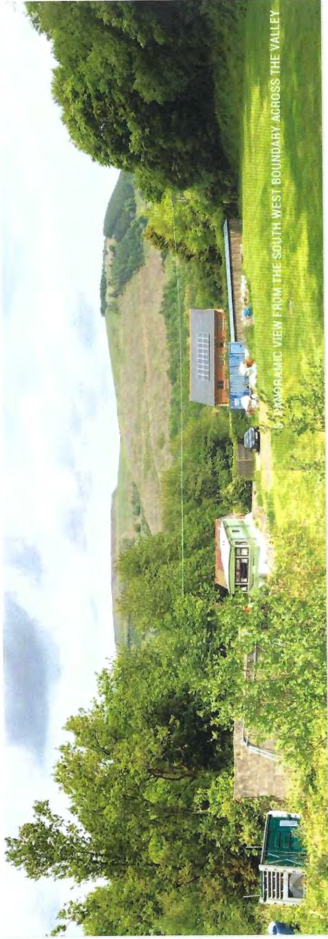
PANORAMIC VIEW FROM THE SOUTH WEST BOUNDARY ACROSS THE VALLEY