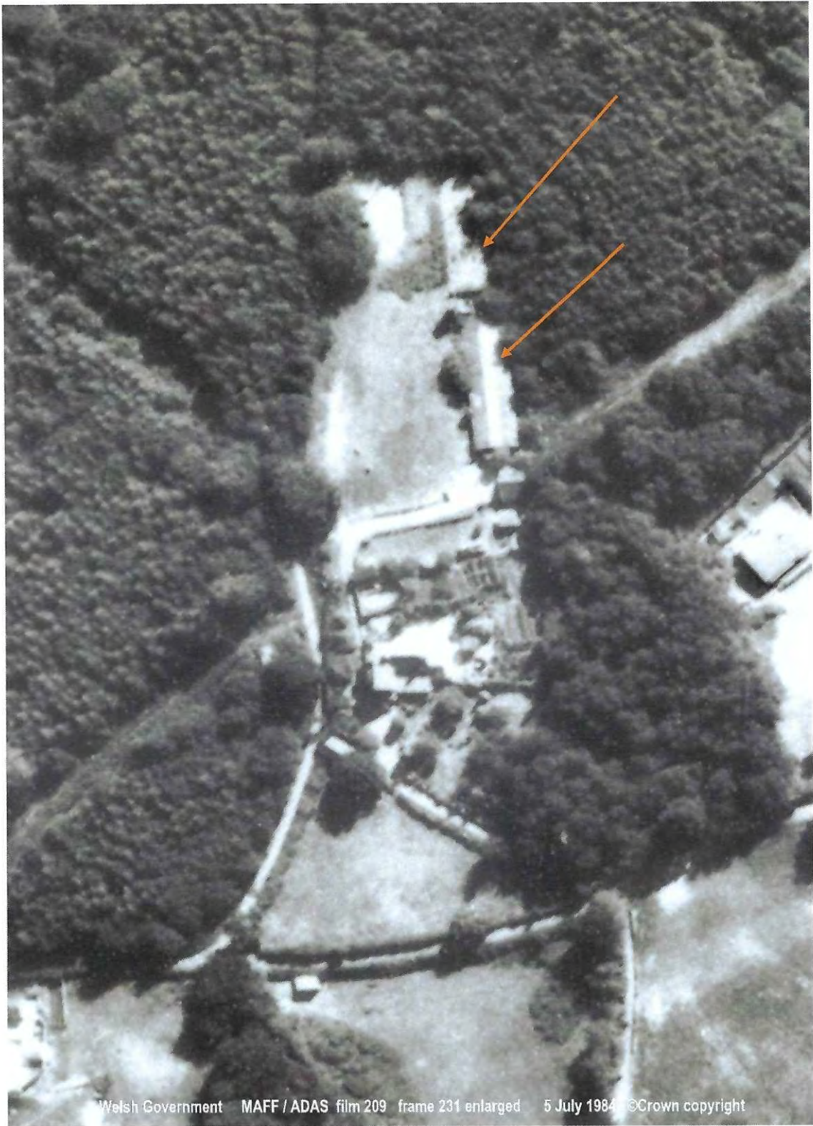
Welsh Government MAFF / ADAS film 209 frame 231 enlarged 5 July 1984