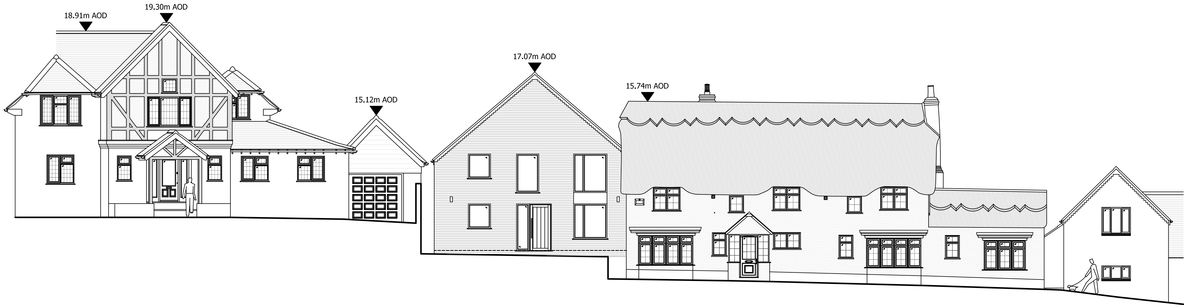
PROPOSED STREET SCENE - SCHOOL LANE OFFCHURCH