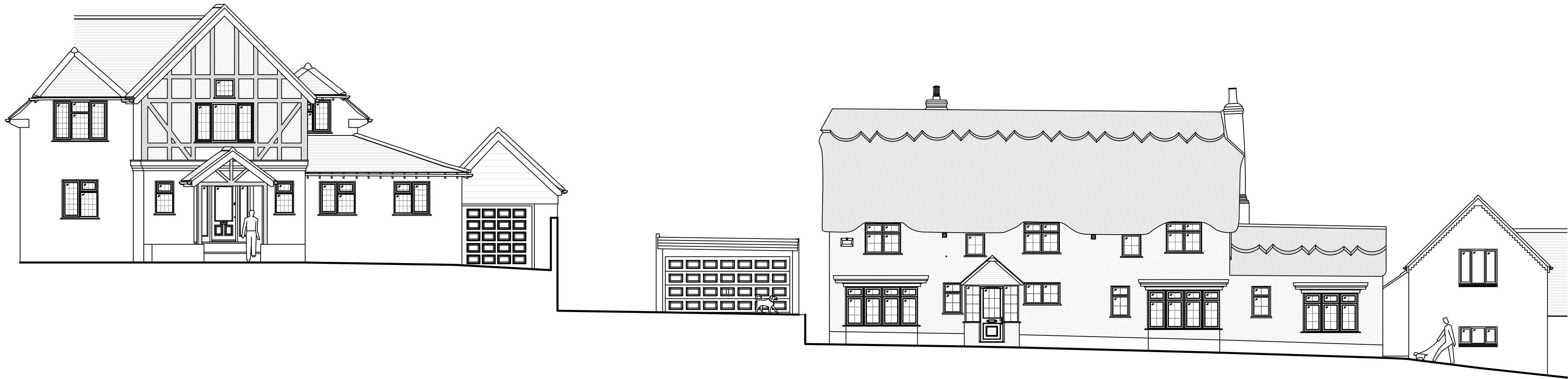
EXISTING STREET SCENE - SCHOOL LANE OFFCHURCH