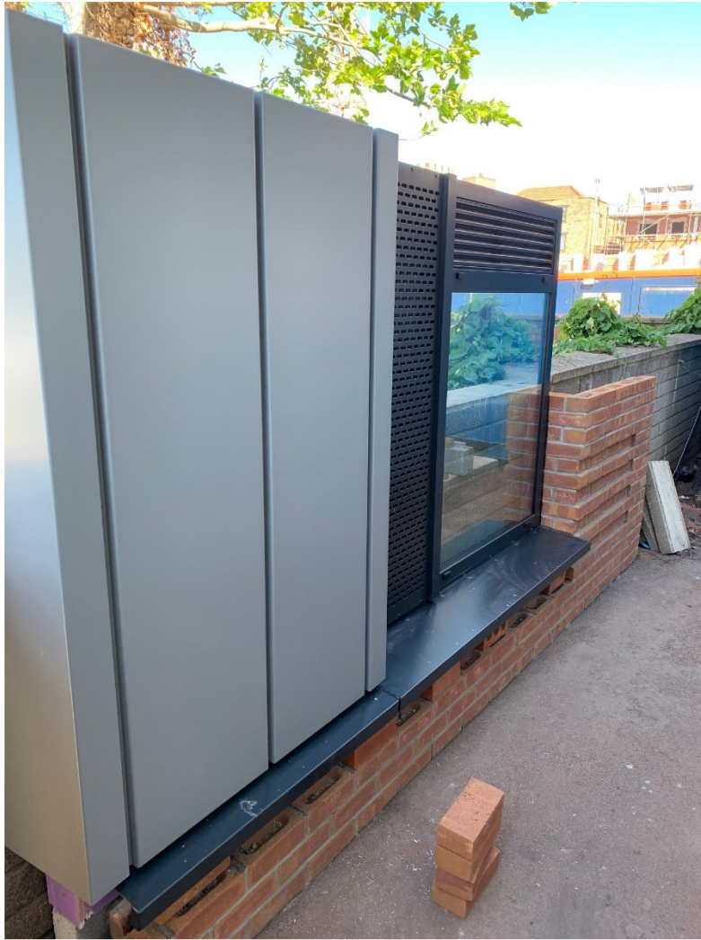
Mock up panel under construction.

7 Constance Street, Knott Mill, Manchester, M15 4JQ 0161 870 1152 timgroomarchitects.com