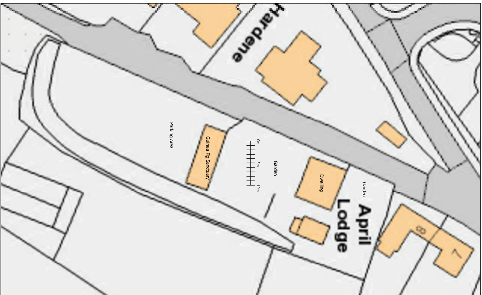
Existing Site Plan 1:500 (A3)