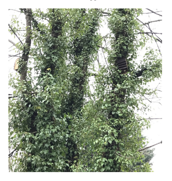
Ref: Bat 2 & 3 East & South Facing Greenkey 695 Medium Bat Box - Natural Wood Installed April 2020