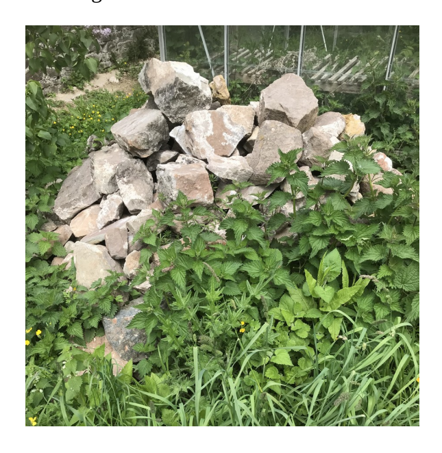
Ref: Reptile 1 Stone pile relocated from rubble piles 1,2 & 3 under the supervision of an ecologist September 2019