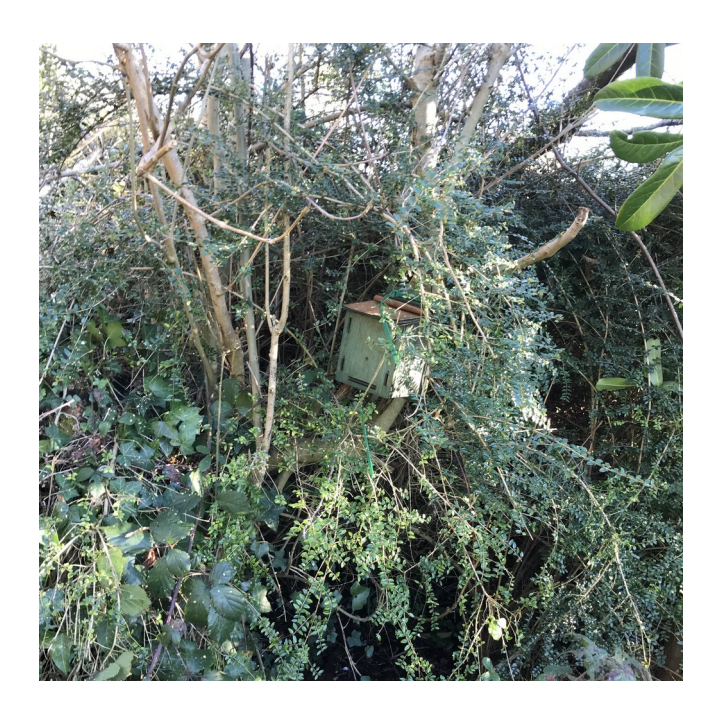
Ref: Dormouse 4 Installed April 2020