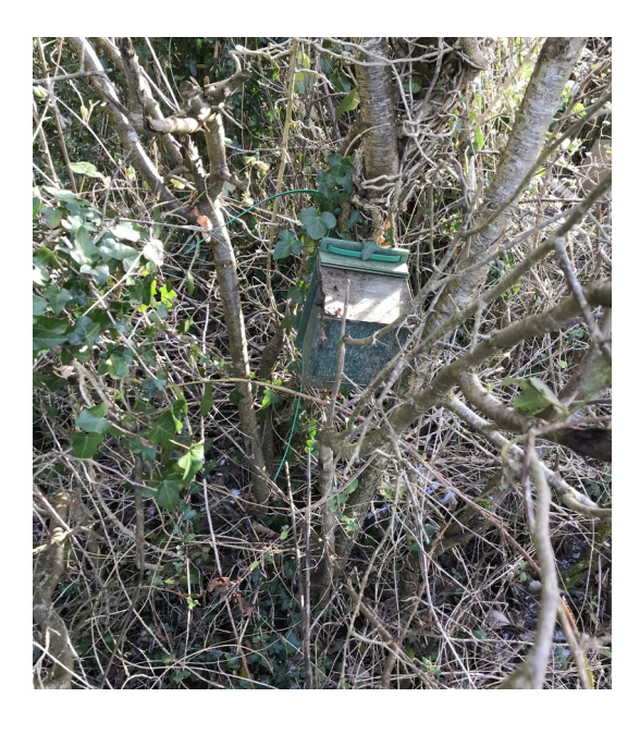
Ref: Dormouse 2 Installed April 2020