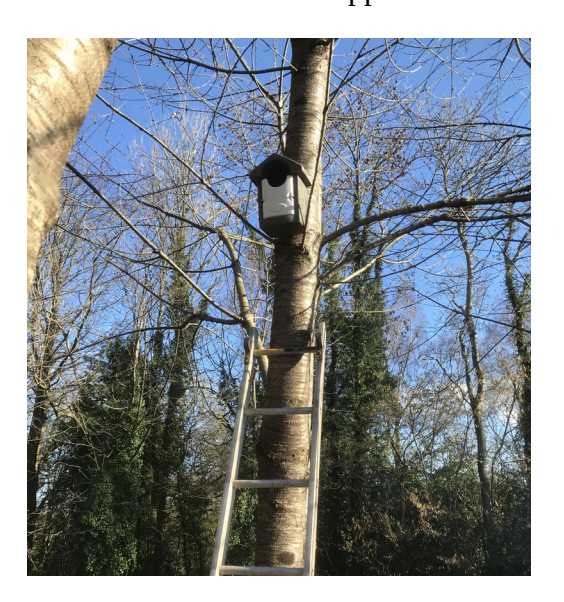
Ref: Bird 2 North Facing Vivara Pro Barcelona WoodStone Open Nest

Product Code: 5051054177250 Installed February 2021