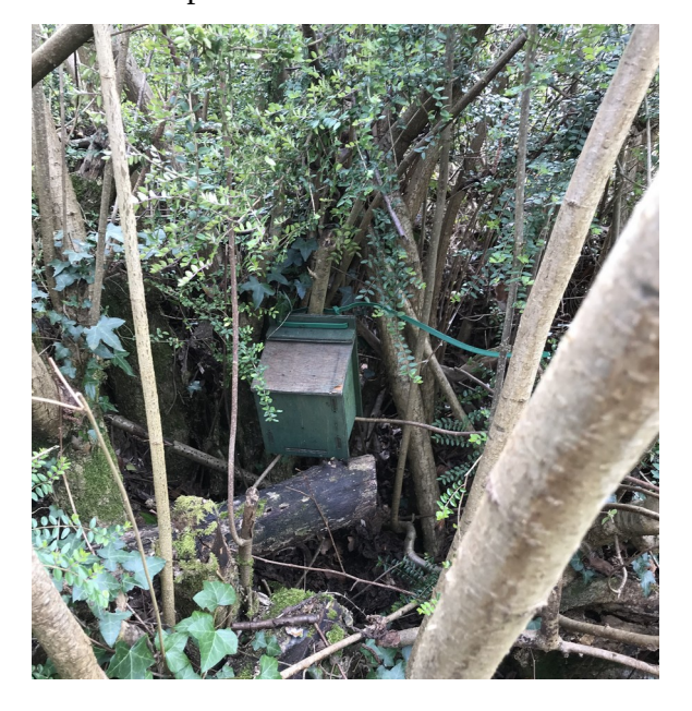
Ref: Dormouse 5 Installed April 2020