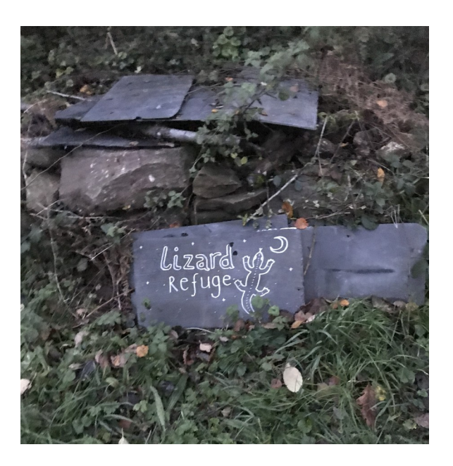
Ref Reptile: 2 Stone pile relocated from rubble piles 1,2 & 3 under the supervision of an ecologist September 2019