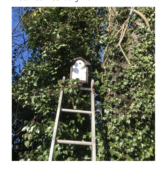
Ref: Bird 4 South facing

Product Code: 5051054177250 Installed February 2021