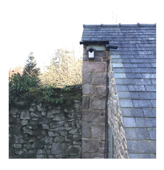
Ref: Bird 1 North Facing Vivara Pro Barcelona WoodStone Open Nest

Product Code: 5051054177250 Installed February 2021