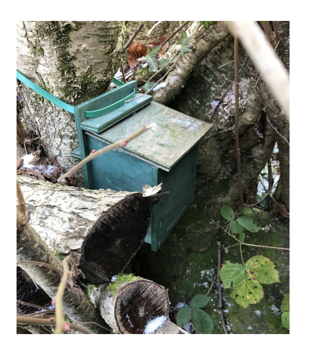
Ref: Dormouse 3 Installed April 2020