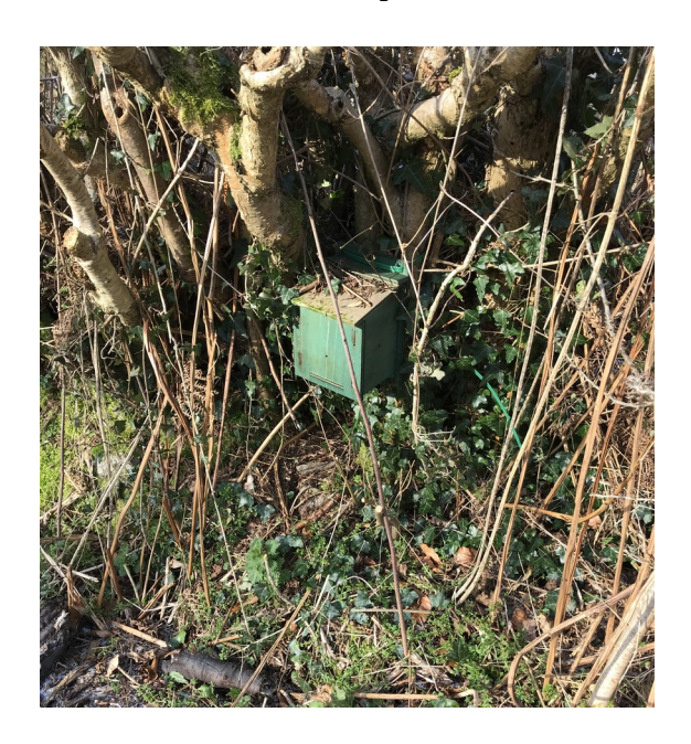
Ref: Dormouse 1 Installed April 2020

• Installation of 5 permanent dormouse boxes.