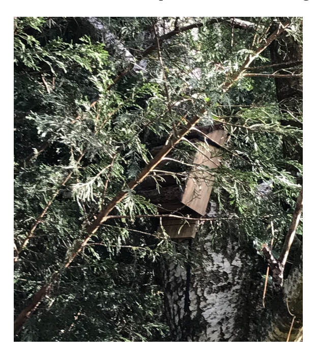
Ref: Bat 1 South facing Greenkey 695 Medium Bat Box - Natural Wood Installed April 2020